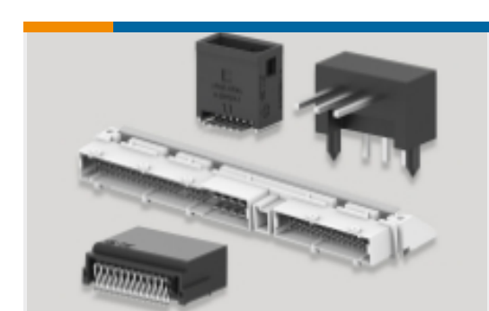
PCB Headers & Receptacles(132)