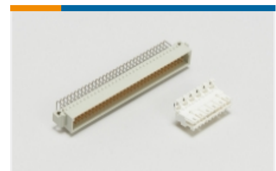
Standard Edge Connectors(8)