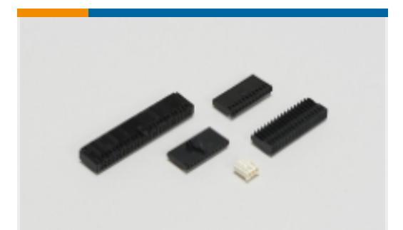
Wire-to-Board Connector Assemblies & Housings(18)