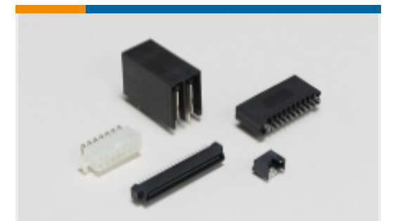
Standard Rectangular Connectors(3)