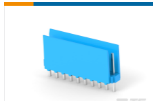
TE Part #281695-6 HE13/HE14 TH Headers, SRST