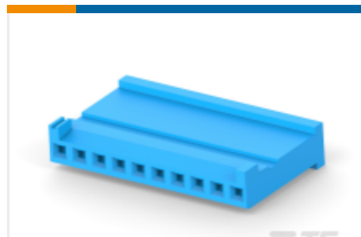
TE Part #1-281838-0 HE13/HE14 Crimp Housings