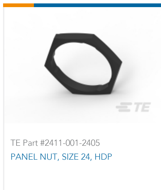
TE Part #2411-001-2405 PANEL NUT, SIZE 24, HDP