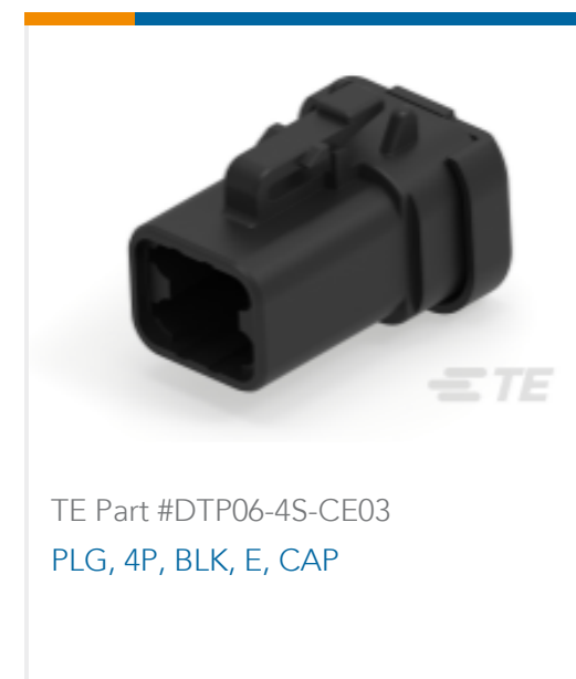
TE Part #DTP06-4S-CE03 PLG, 4P, BLK, E, CAP