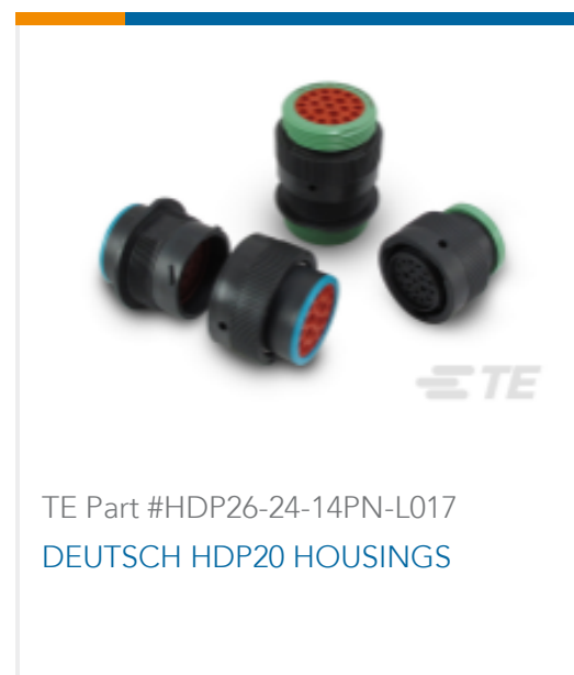
TE Part #HDP26-24-14PN-L017 DEUTSCH HDP20 HOUSINGS