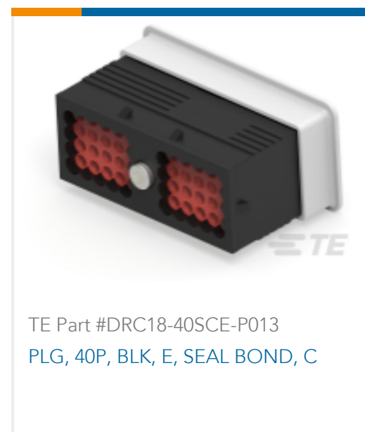
TE Part #DRC18-40SCE-P013 PLG, 40P, BLK, E, SEAL BOND, C