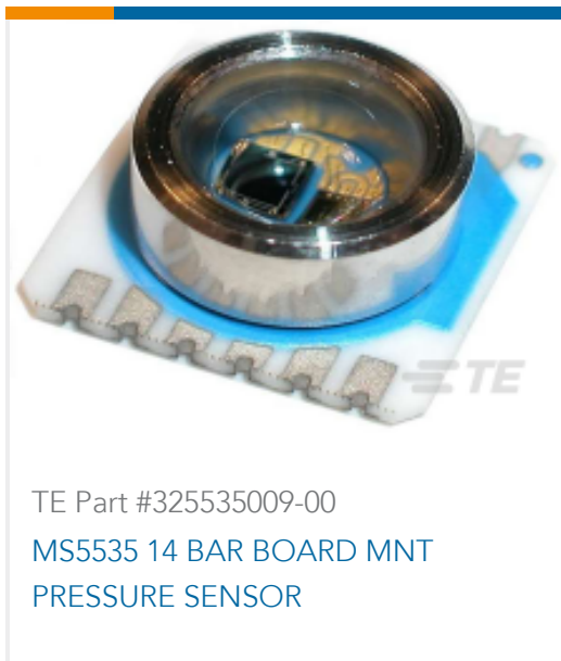
TE Part #325535009-00 MS5535 14 BAR BOARD MNT PRESSURE SENSOR