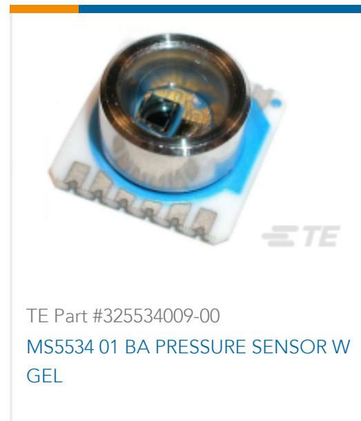
TE Part #325534009-00 MS5534 01 BA PRESSURE SENSOR W GEL