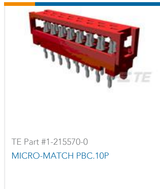
TE Part #1-215570-0 MICRO-MATCH PBC.10P