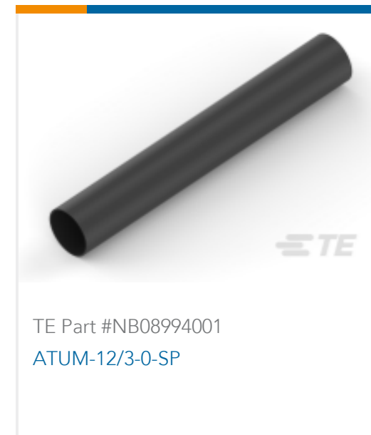
TE Part #NB08994001 ATUM-12/3-0-SP