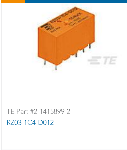
TE Part #2-1415899-2 RZ03-1C4-D012