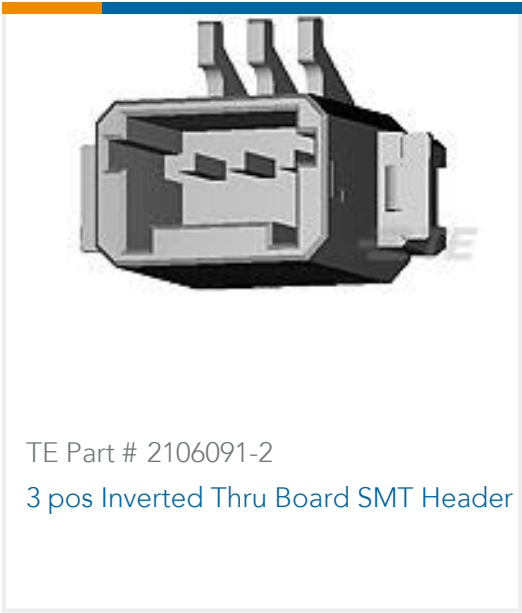
TE Part # 2106091-2 3 pos Inverted Thru Board SMT Header