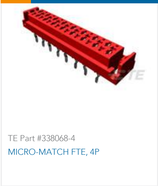
TE Part #338068-4 MICRO-MATCH FTE, 4P