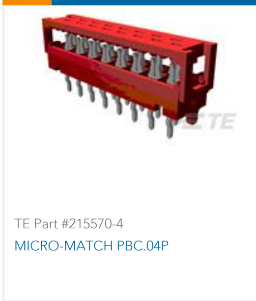
TE Part #215570-4 MICRO-MATCH PBC.04P