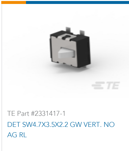
TE Part #2331417-1 DET SW4.7X3.5X2.2 GW VERT. NO AG RL