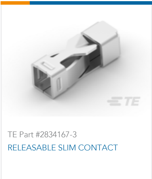
TE Part #2834167-3 RELEASABLE SLIM CONTACT