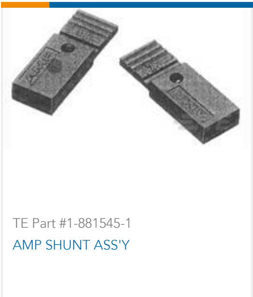
TE Part #1-881545-1 AMP SHUNT ASS'Y