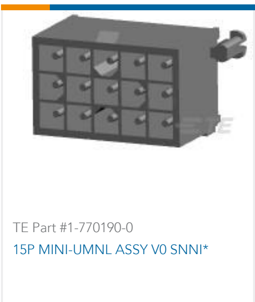
TE Part #1-770190-0 15P MINI-UMNL ASSY V0 SNNI*