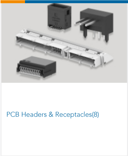
PCB Headers & Receptacles(8)