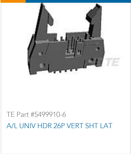
TE Part #5499910-6 A/L UNIV HDR 26P VERT SHT LAT