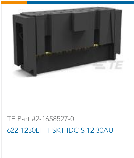
TE Part #2-1658527-0 622-1230LF=FSKT IDC S 12 30AU