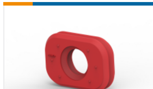
TE Part #2103154-2 CABLE SEAL, SIZE 2, HVA280