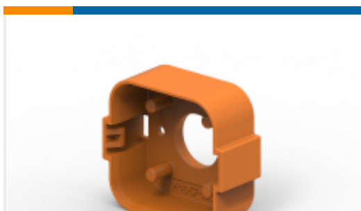
TE Part #2141265-3 COVER,SEAL