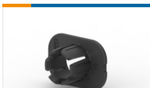
TE Part #2103155-2 COLLET, SIZE 2, HVA280