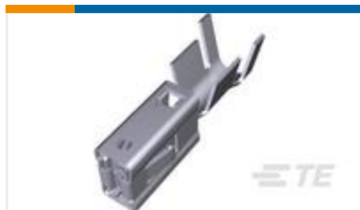
TE Part #2-1241408-3 AMP MCP 6.3/4.8K, CONTACT