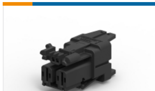
TE Part #2141259-1 2POS, MIXED,REC HSG,ASSY