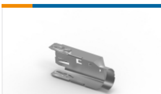
TE Part #2141262-3 SHIELDING,EMC