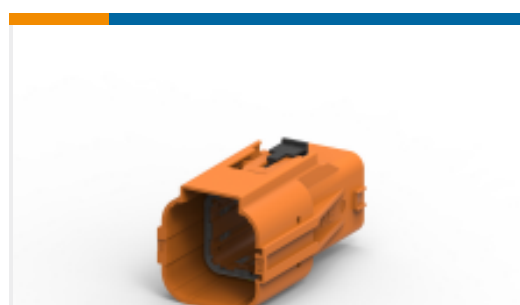
TE Part #2141256-1 2POS,AMP MCP6.3/4.8K,REC HSG, ASSY