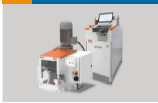
High Voltage Wire Processing Equipment(14)