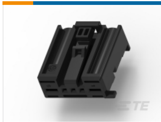
TE Part #1379217-5 5POS MIXED MQS REC COD A