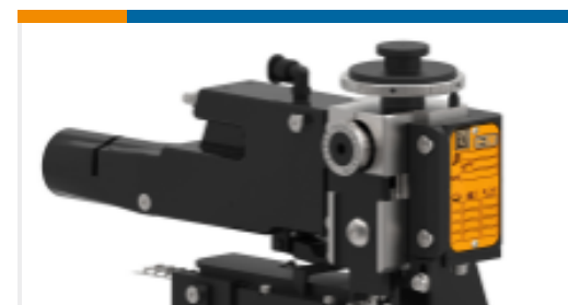
TE Part # 2-2151658-2 OCEAN-2.0-APPLICATOR-S-040F114O