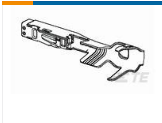
TE Part #2141970-1 MCON 1.2 LL REC SWS SN