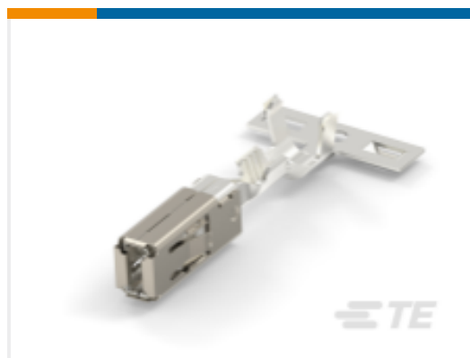
TE Part #1-2141859-3 AMP MCP 2.8, CONTACT