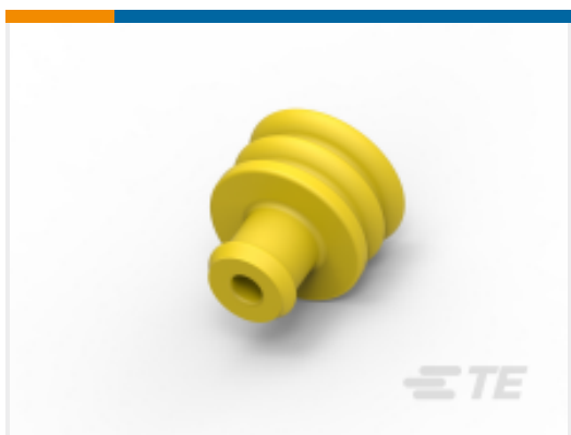
TE Part #2236402-1 SINGLE WIRE SEAL,AMP MCP2.8