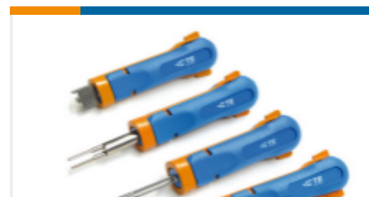
TE Part # 3-1579028-8 EXTRACTION TOOL