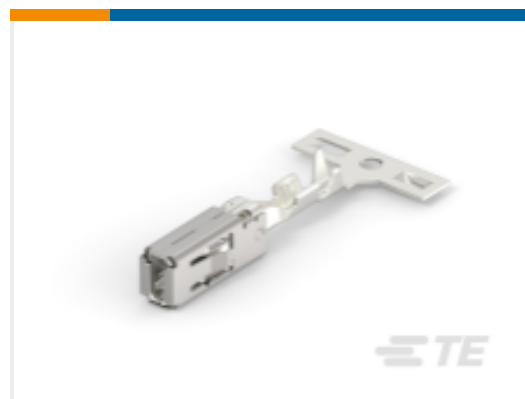
TE Part #1-2141857-3 AMP MCP 2.8, CONTACT