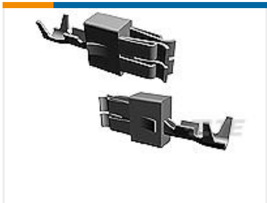
TE Part #927840-5 SPT REC 6.3 Contact SRC Ag