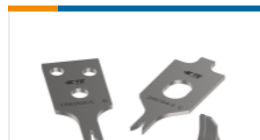
TE Part # 7-2151658-7 OCEAN-2.0-SPARE-PART-KIT-040F114O

Also in the Series | MCON Interconnection System