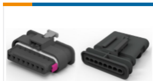
TE Part # CAT-M4595-CH8172 MCON, CONNECTOR HOUSING