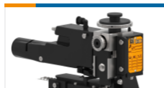
TE Part # 7-2151658-2 OCEAN-2.0-APPLICATOR-S-040F114O