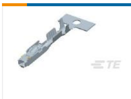
TE Part #1563888-1 MCON 1.2 LL REC SRC AU SHORT CIRCUIT