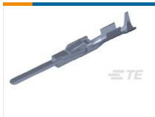
TE Part #5-1418760-2 MCON 1.2 LL TAB STC AU