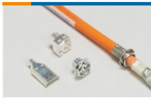
Automotive Connector EMC Shielding (5)