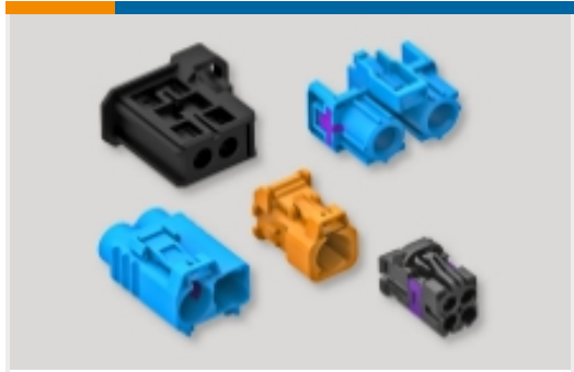
Data Connectivity Housings(415)