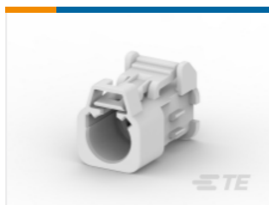
TE Part #2138710-2 PLUG HOUSING, 1 POSITION, 180