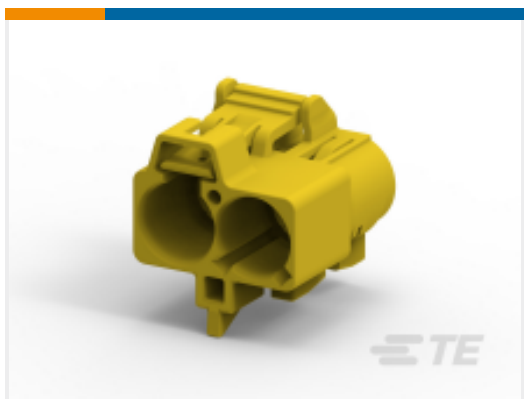
TE Part #6-1924856-0 Plug HOUSING, 2 POSN, FAKRA, Key K, dp