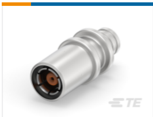
TE Part #1438918-1 PLUG SUBASSEMBLY, RG-58 AND RG-58LL, 180