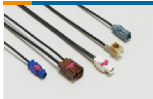
Infotainment & Multimedia Cable Assemblies(1)