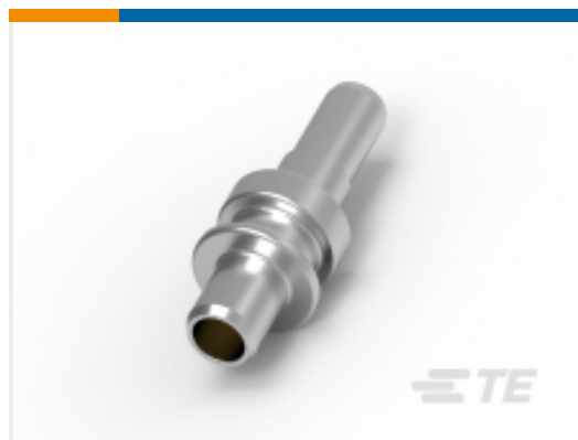
TE Part #1438910-1 JACK SUBASSEMBLY, RG-58 AND RG-58LL, 180