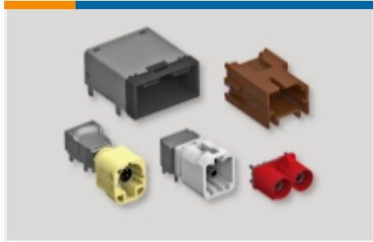
Data Connectivity Headers(358)