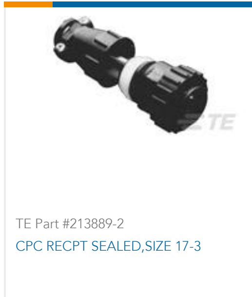
TE Part #213889-2 CPC RECPT SEALED,SIZE 17-3