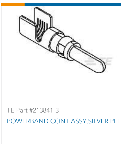
TE Part #213841-3 POWERBAND CONT ASSY, SILVER PLT