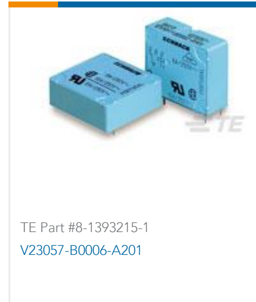
TE Part #8-1393215-1 V23057-B0006-A201