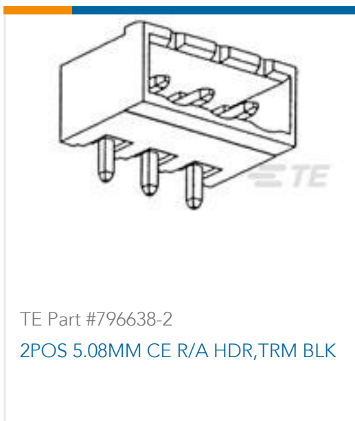
TE Part #796638-2 2POS 5.08MM CE R/A HDR,TRM BLK