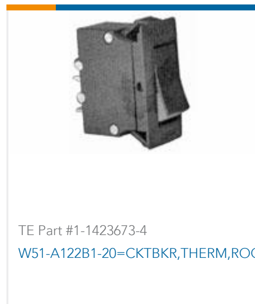
TE Part #1-1423673-4 W51-A122B1-20=CKTBKR, THERM, ROC