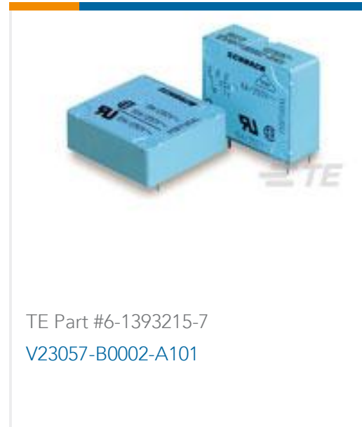
TE Part #6-1393215-7 V23057-B0002-A101