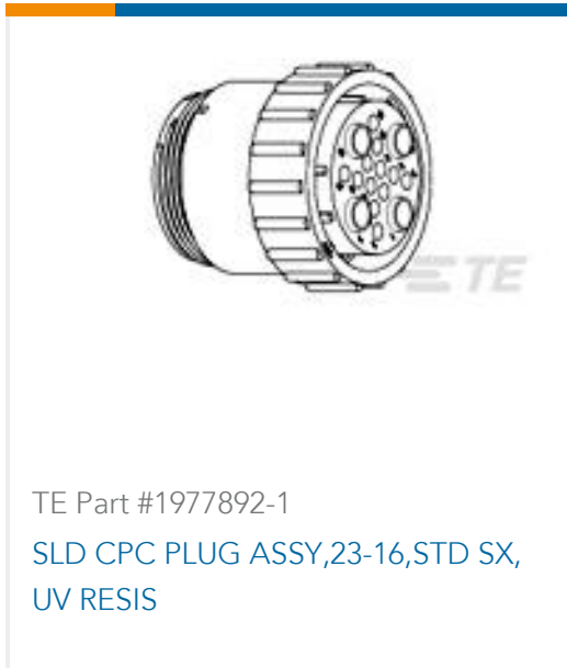
TE Part #1977892-1 SLD CPC PLUG ASSY,23-16,STD SX, UV RESIS