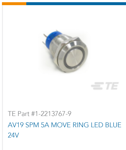
TE Part #1-2213767-9 AV19 SPM 5A MOVE RING LED BLUE 24V