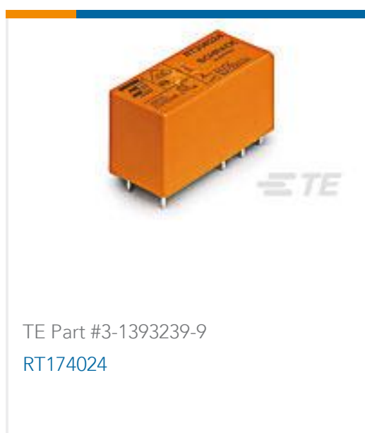
TE Part #3-1393239-9 RT174024