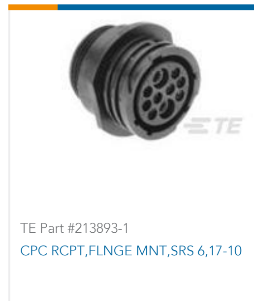
TE Part #213893-1 CPC RCPT, FLNGE MNT, SRS 6, 17-10