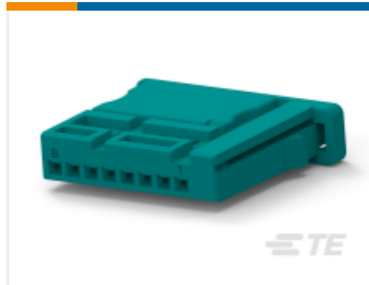
TE Part #2282267-9 8POS,NANOMQS,REC HSG,CODZ