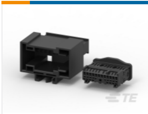
TE Part #2141404-9 MQS, CONNECTOR HOUSING