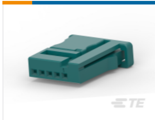
TE Part #2282153-9 5POS,NANOMQS,REC HSG,CODZ