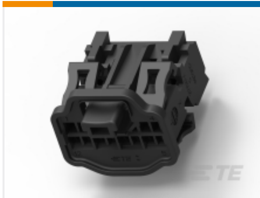
TE Part # 2177587-1 12POS NANO MQS TL PLUG HOUSING, CODE A