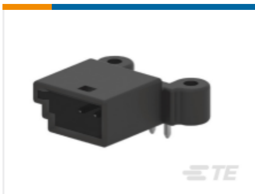
TE Part #1-1355154-1 SIGNAL HEADER