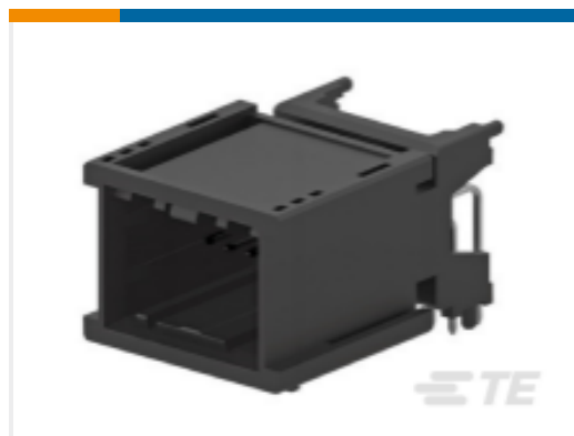
TE Part #2177766-3 MINIATURIZED HEADER