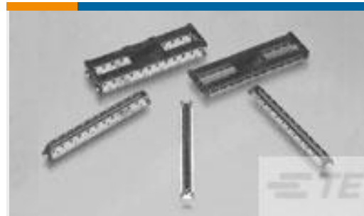
TE Part #3-1939756-6 .5FHP08H,220,S,GIG,30/Sn,HT,NS