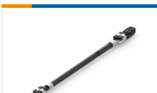
TE Part #2362764-5 MATENET,CABLE ASSY,1 GBPS UTP