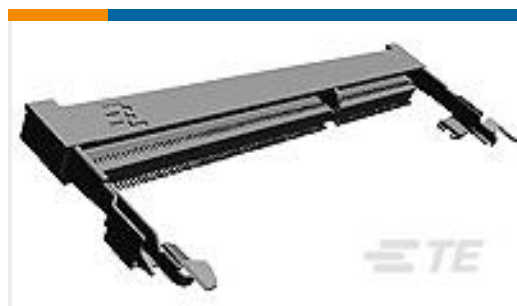
TE Part #2-2013298-1 EMBOSS TAPE DDR3 204P 8H RVS