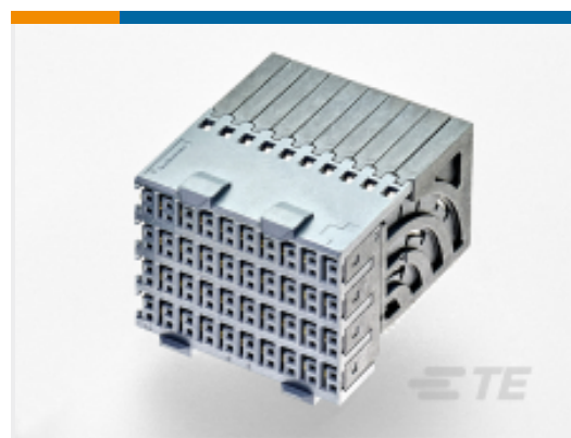
TE Part # 2170903-1 RECEPTACLE HM-EZD+, 4PAIRS 10COLUMNS