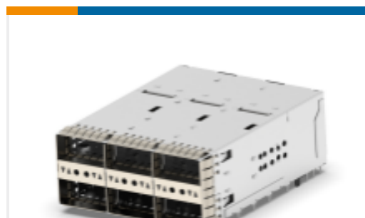
TE Part #2227671-9 ZQSFP+ STACKED REC ASSEMBLY 2X3,4LP R UP