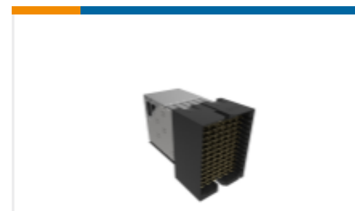
TE Part #2274518-1 SW PIR/DPO RA ASSY 12P6C 100 OHM 90 GR