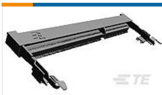
TE Part #2-2013311-1 EMBOSS TAPE DDR3 204P 9.2H RVS