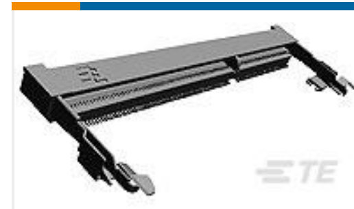
TE Part #2-2013287-1 EMBOSS TAPE DDR3 204P 4H RVS