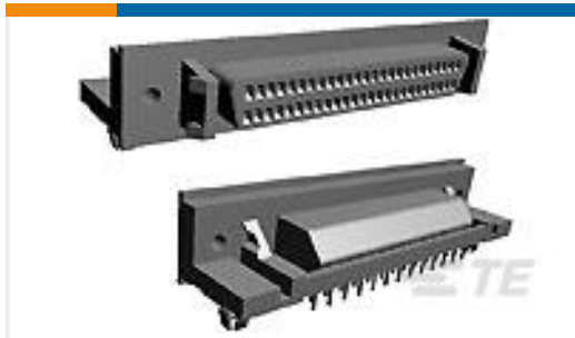
TE Part #5787082-9 100 50SR R/A RCP ASSY,RDSN L/F