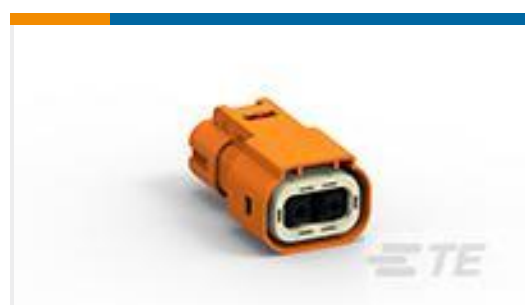
TE Part #2103149-7 PLUG, HVIL ONLY, KEY Z, HVA280-2PHI