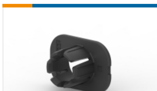
TE Part #2103155-2 COLLET, SIZE 2, HVA280