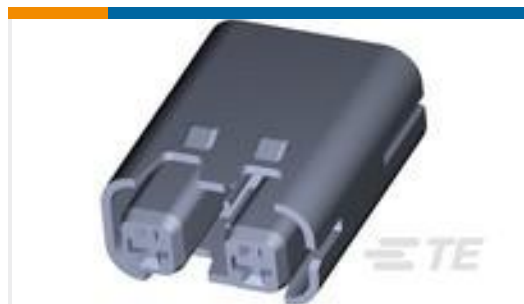
TE Part #1587985-1 INNER HSG SUBASSY, HVA280-2PHM