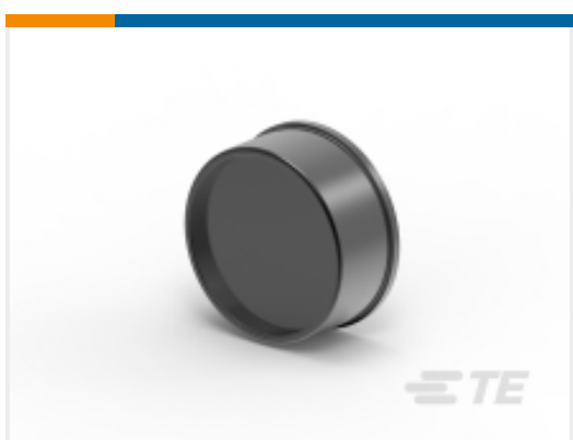
TE Part #2141261-1 SHIELD CRIMP FERRULE,INNER