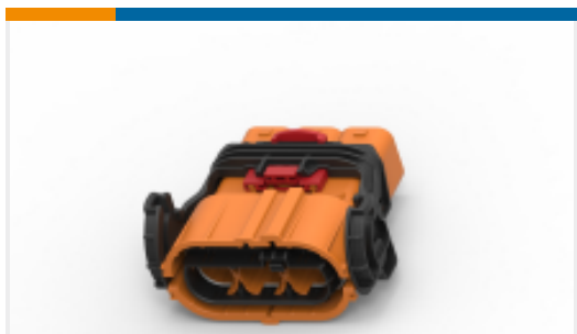
TE Part #1-2177063-2 3POS,8MM HV,PLUG HSG,ASSY, SEALED