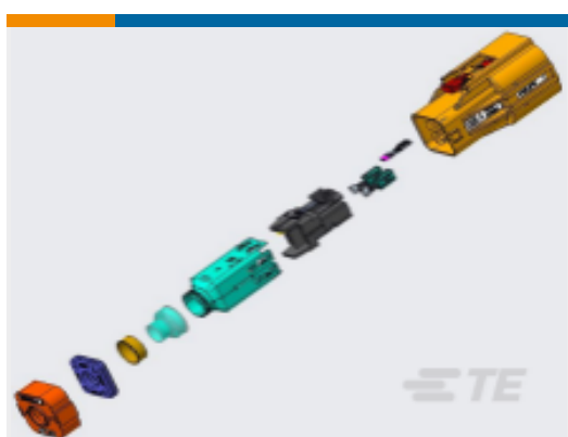
TE Part #YHVA630-2PHM-4MM-A HVA630-2pnm,4sqmm,Key A