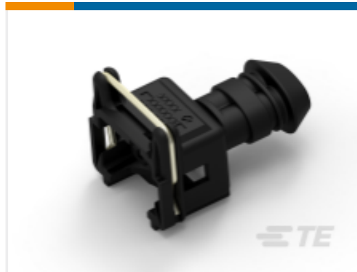
TE Part #1703727-1 2POS, JPT, HOUSING, ASSY, BK