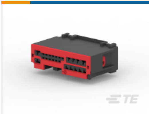
TE Part #1563307-2 24POS, MIXED, REC HSG, ASSY