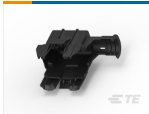
TE Part #1456722-1 Wire Guide, 34 Way, Right Out