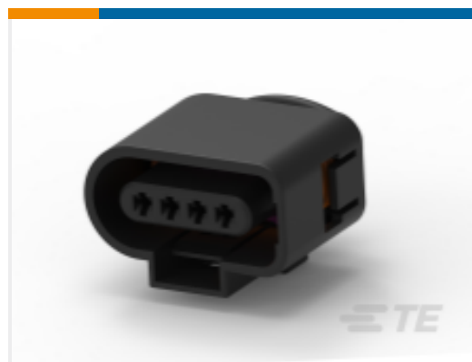
TE Part #444515-2 MICRO TIMER CONN 4P