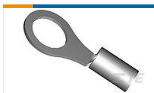
TE Part #33468 TERMINAL,SOLIS R 4 10