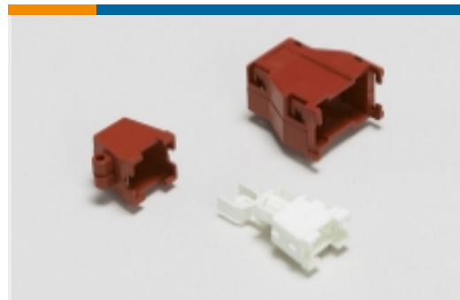
Rectangular Boots & Strain Relief(5)