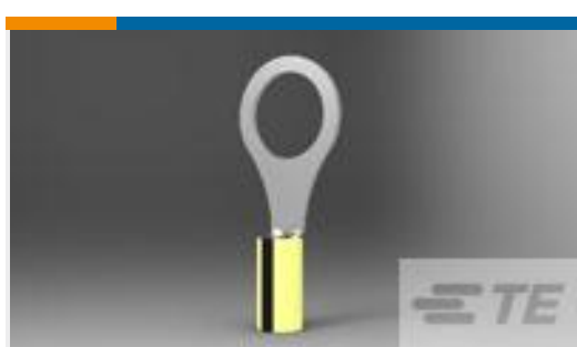
TE Part #330896 TERMINAL,PIDG R 16-14HD 3/8