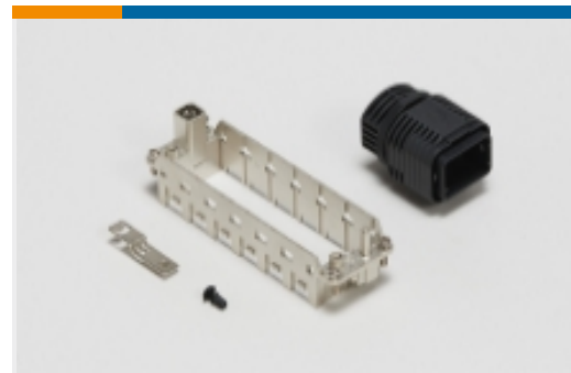
Rectangular Connector Hardware(3)