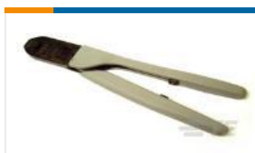
TE Part #91523-1 CCII TYPE III+ PIN SKT 24-16 ASSY