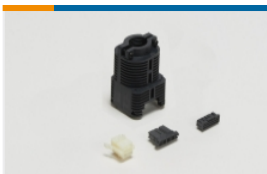
Rectangular Connector Housings(35)