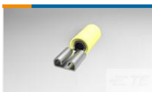
TE Part #640907-1 RECEPT,PIDG FASTON 12-10 250