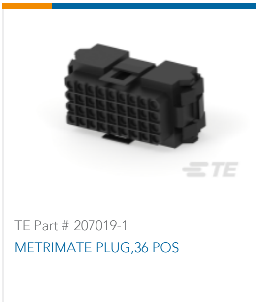
TE Part # 207019-1 METRIMATE PLUG,36 POS