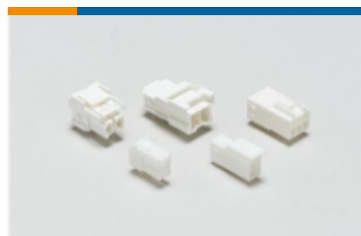
Rectangular Power Connectors(2)