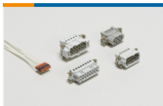
Rectangular Contact Inserts(4)