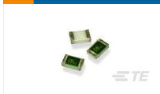
TE Part #3-1879208-7 CPF 0402 330R 0.1% 25PPM 1K RL