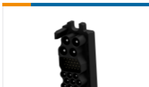
TE Part #1926171-1 CONN,PIN,75Amp MIDDLE DWR