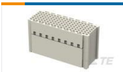
TE Part #1-2102061-2 Mezalok, Socket, 114 p, 18 mm, 30 Au, LF