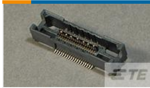
TE Part #5767171-1 MICTOR RECEPT ASSY, 38 POS. TA