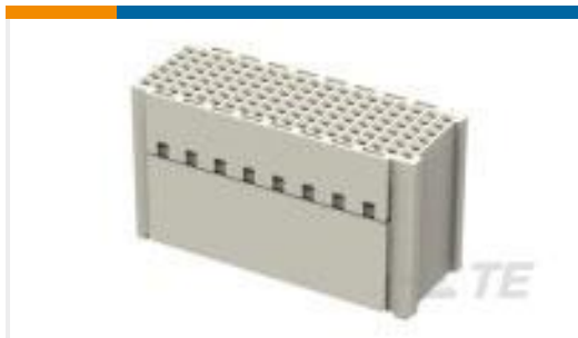
TE Part #1-2102061-0 Mezalok, Socket, 114 p, 18 mm, 50 Au, LF