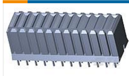
TE Part #120953-4 UPM EXPANDED RCPT ASSEMBLY