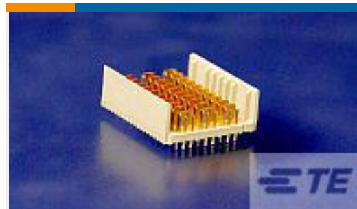
TE Part #2170245-1 HMZD+,3PAIRS,10COLS,VERTICAL, ASSEMBLY