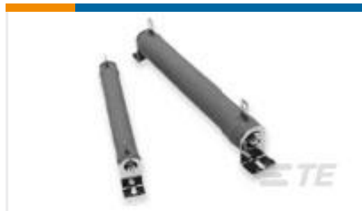
TE Part #2-1879447-9 TE 200W 220R 5% Bracket