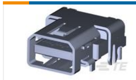
TE Part #2129320-3 Mini Displayport Reverse Offset