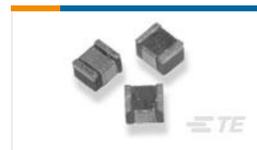
TE Part #6-1624112-9 3650 0603 6.8nH 5% 2K RL