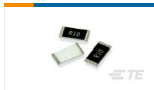
TE Part #2-2176058-4 RLP73N 3A R091 5% 2K RL