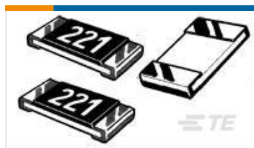
TE Part #2176071-1 3521 130K 1% 2W