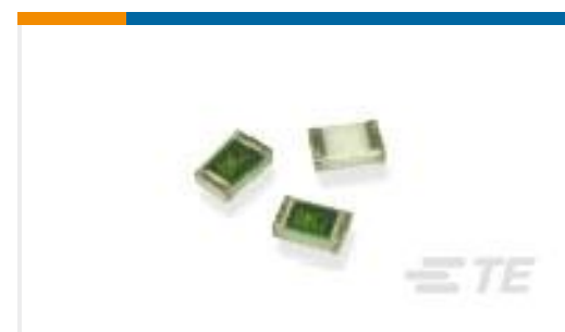
TE Part #8-1879028-8 RN 0805 432K 0.1% 10PPM 1K RL