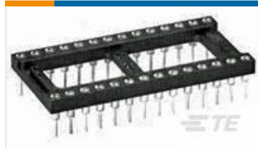
TE Part #9-1437539-1 828-AG11D-ES=SOCKET ASSY