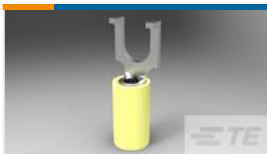
TE Part #326865 TERMINAL,PIDG SPD FLG 12-10 10