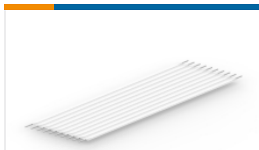
TE Part #5-1474644-8 FSN-24A-16