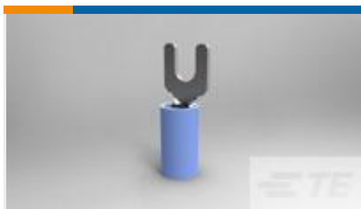
TE Part #2-35559-1 TERMINAL,PIDG SPD 16-14 6