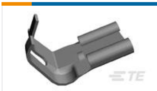
TE Part #60583-2 250 FASTON FLAG REC 12-10 AWG TPBR