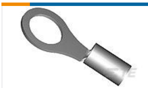
TE Part #321872 TERMINAL,SOLIS R 2/0 7/16