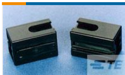
TE Part #557313-1 MOUNTING ADAPTR,AMPINERGY WTW