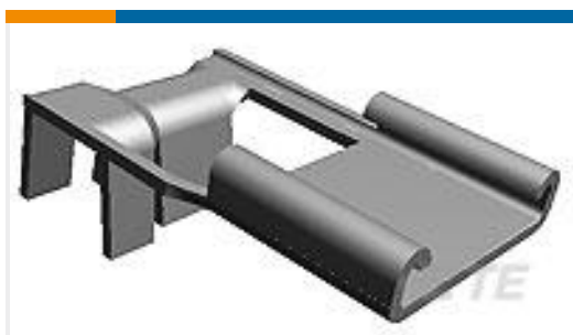
TE Part #60419-2 250 FASTON FLAG REC 18-14 AWG TPBR