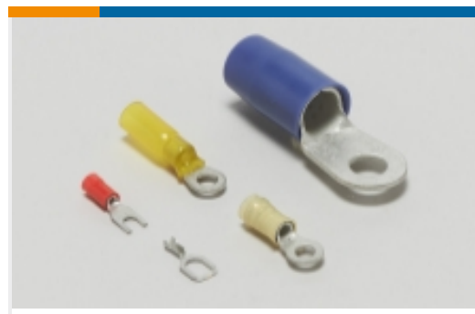
Ring Terminals & Spade Terminals(538)