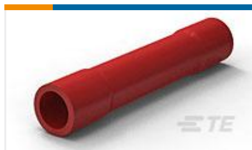
TE Part #1-34243-1 PG BUTT SPLC 22-16COMM22-18MIL