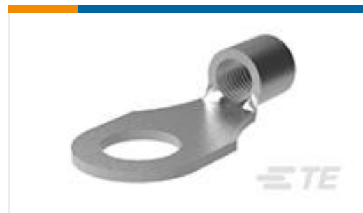
TE Part #321879 TERMINAL,SOLIS R 4/0 7/16