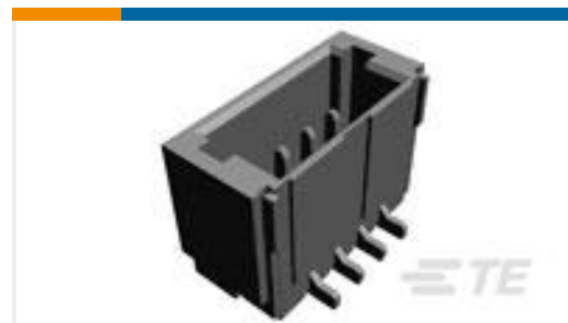
TE Part #1-1734595-0 1.0 WTB SR VT HDR 10 POS