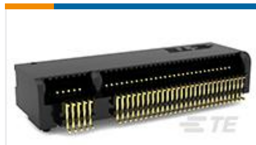
TE Part #2199230-3 M.2 0.5PITCH 4.2H KEY B 15U" AU