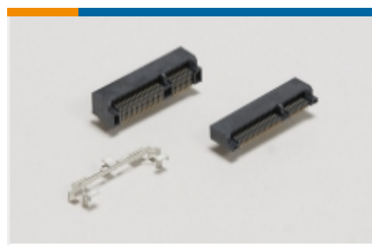
Mini PCI Express &amp; mSATA(6)