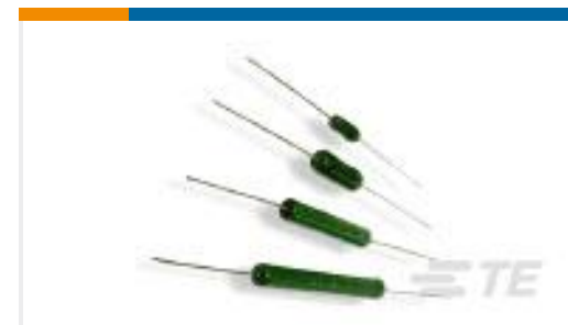
TE Part #3-1623774-1 C14 3K3 5% (LOOSE)