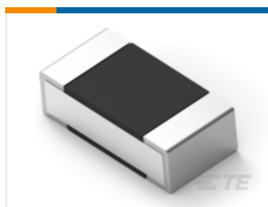
TE Part #7-2176307-9 RP 1E 0.1W 80K6 0.1% 25PPM 5K RL