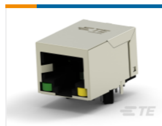
TE Part #2337992-8 RJ45 JACK MAG. POE 1GB LED 1X1