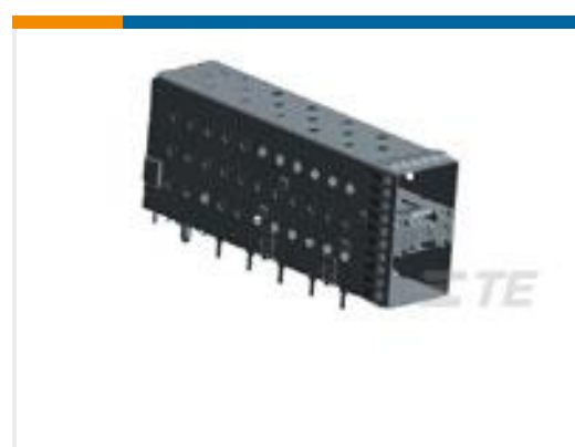
TE Part #1-2007492-7 SFP+assy2x1 EMI Sprng Outer Lp Sn Enhance