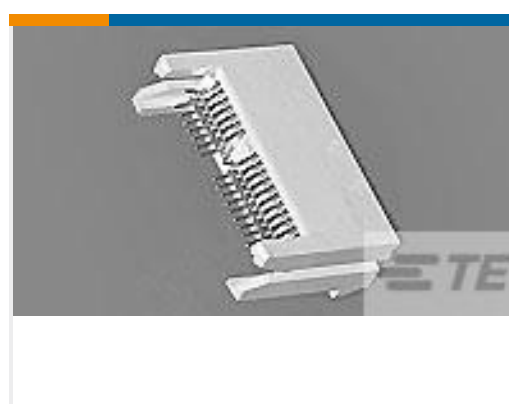
TE Part #8-1734857-5 PCI EXP STRADDLE 164P BLK 30u"