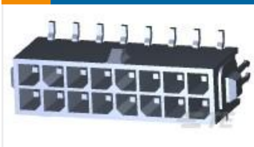
TE Part #4-794634-6 16P MICRO MNL ASSY,VRT,SMT LF