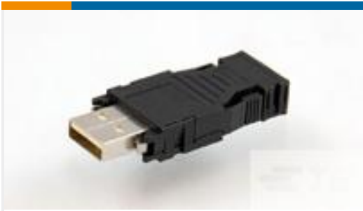
TE Part #1827525-1 MECHATROLINK II CONNECTOR KIT