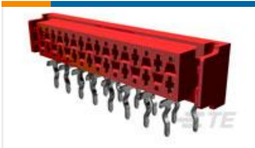
TE Part #1-338070-0 MICRO-MATCH FEM.SE