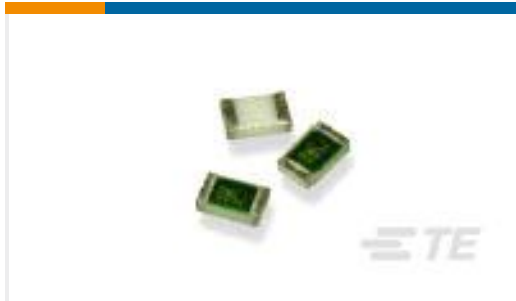
TE Part #8-1879215-3 CPF 0402 33K2 0.1% 25PPM 1K RL