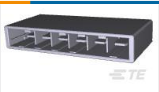
TE Part #2-179960-2 DYNAMIC D-5200 HDR ASSY 6P V Y