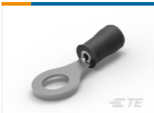
TE Part #35316 PIDG RING TONGUE TERMINALS