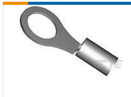
TE Part #320758 TERMINAL,SOLIS R 16-14HD 5/8