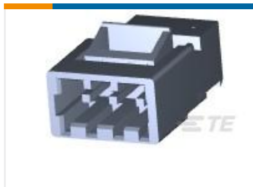
TE Part #3-641437-3 03P MTA156 PSTD CONN ASSY RED