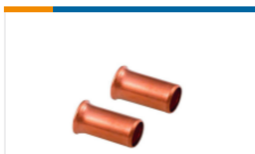
TE Part #BM3036-000 CPGI-CCS-18-10-C-100