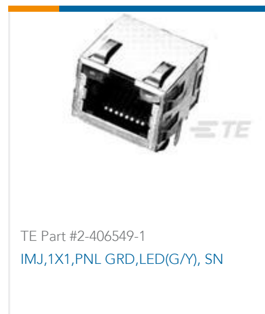
TE Part #2-406549-1 IMJ,1X1,PNL GRD,LED(G/Y), SN