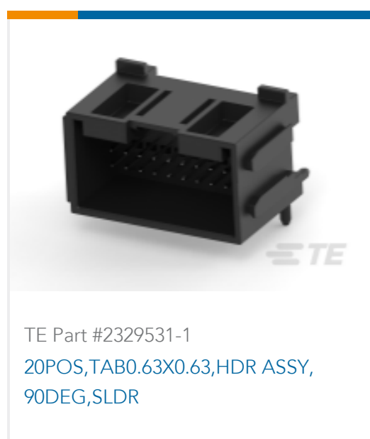
TE Part #2329531-1 20POS,TAB0.63X0.63,HDR ASSY, 90DEG,SLDR