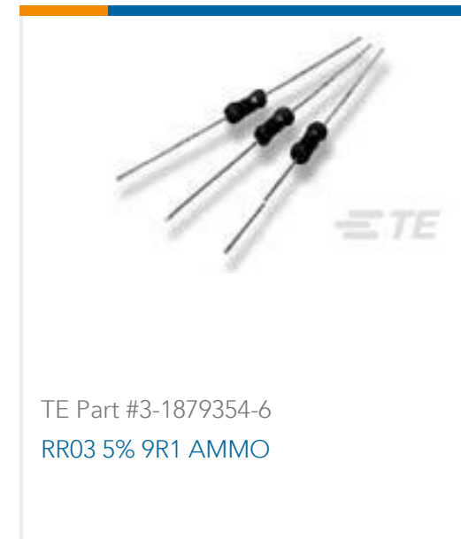
TE Part #3-1879354-6 RR03 5% 9R1 AMMO