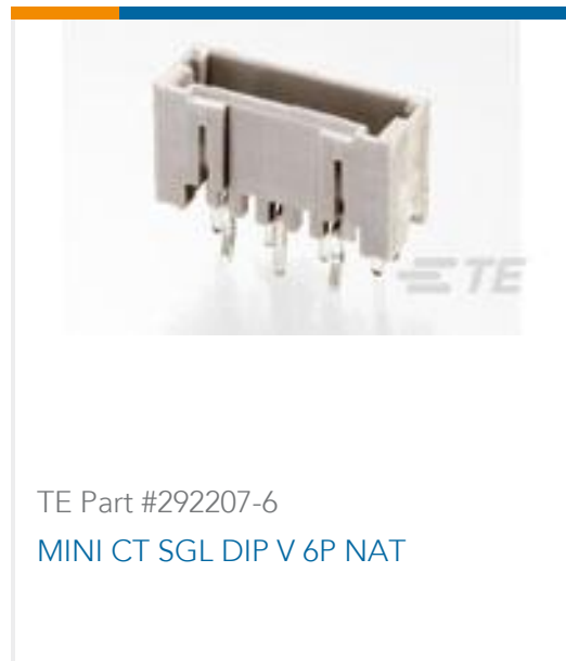
TE Part #292207-6 MINI CT SGL DIP V 6P NAT