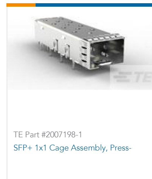
TE Part #2007198-1 SFP+ 1x1 Cage Assembly, Press-