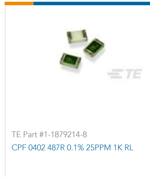
TE Part #1-1879214-8 CPF 0402 487R 0.1% 25PPM 1K RL