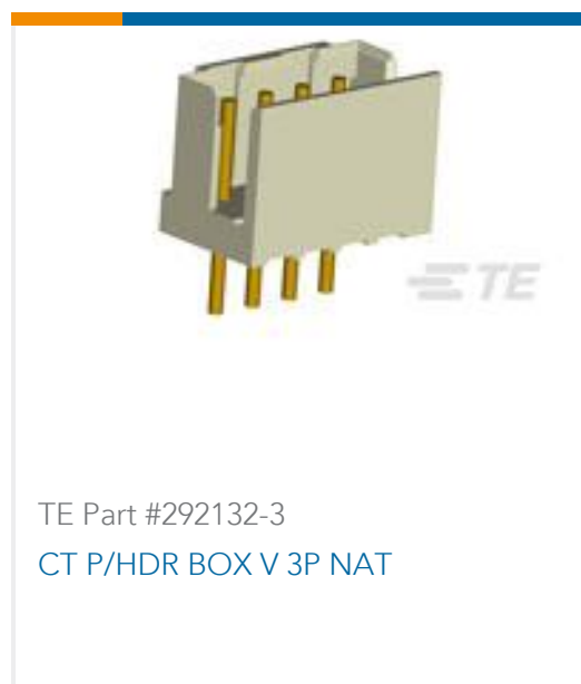
TE Part #292132-3 CT P/HDR BOX V 3P NAT