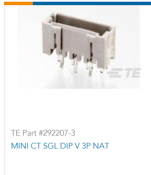
TE Part #292207-3 MINI CT SGL DIP V 3P NAT