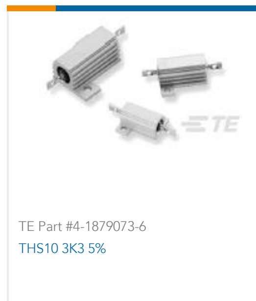
TE Part #4-1879073-6 THS10 3K3 5%