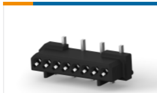
TE Part #3-1827159-8 1.25FP,R08,SL,B,C,TR