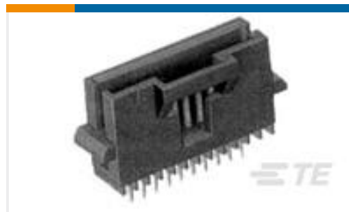
TE Part #5-146085-1 10 SYSTEM 50 HDR SRST SHRD SN