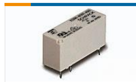
TE Part #1416200-9 V23061B1010A301