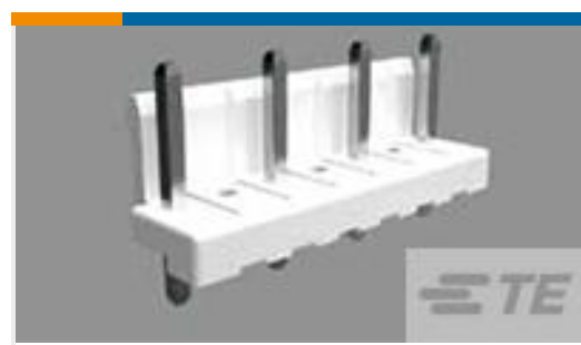
TE Part #1-1123724-3 3.96EP HDR ASSY 3(5)P NATURAL