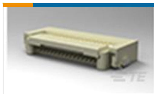
TE Part #3-1775333-4 ZIF FPC 0.5, 2H, 34P