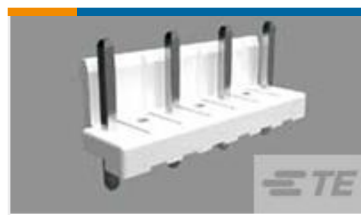
TE Part #1-1123724-4 3.96EP HDR ASSY 4(7)P NATURAL