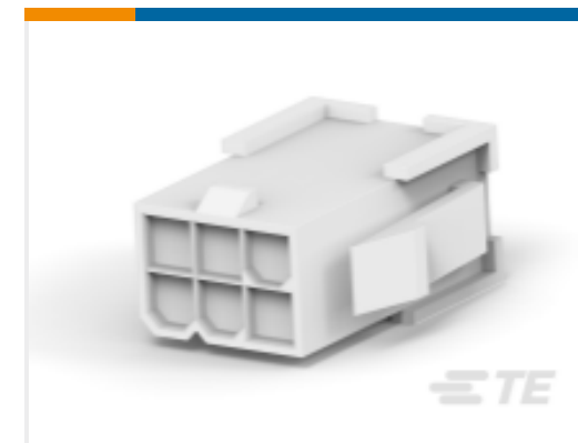
TE Part # 2296207-6 6P PM PLUG VAL-U-LOK PM GWT/V0