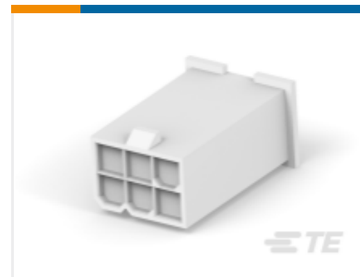
TE Part # 2296206-6 6P FH PLUG VAL-U-LOK FH GW