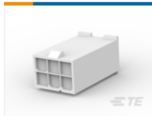
TE Part # 1586862-6 6P FH PLUG VAL-U-LOK FH GW