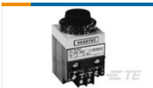
TE Part #3-1423157-7 7012CB=RLY,STD,ON,2P,480VAC,5