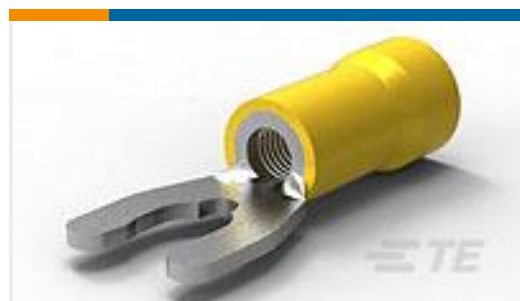
TE Part #52963-5 TERMINAL,PG SPR SPD 12-10 10