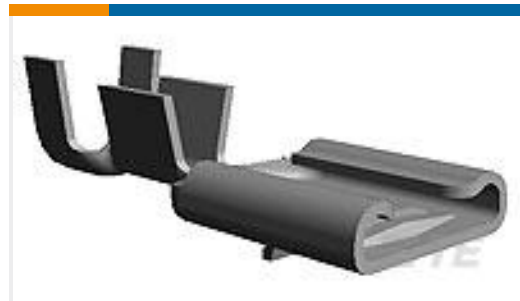
TE Part #42663-2 FF 312 REC 16-12AWG TPBR