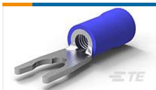
TE Part #53244-2 TERMINAL,PG SPR SPD 16-14 8