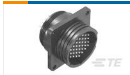
TE Part #1-208223-1 CPC RCPT ASSEMBLY SIZE 13-9