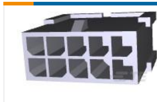
TE Part #1-794616-0 FREE HANG DBL ROW HSG 10 POS