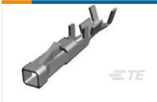
TE Part #1-794611-2 MICRO MNL RPT CNT,LS PC,30AU L