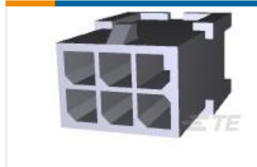
TE Part #794616-6 FREE HANG DBL ROW HSG 6 POS