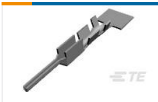
TE Part #1-794608-1 PIN CONT 20-24 15 GOLD STRIP