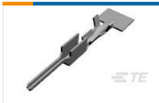
TE Part #1-794609-0 PIN CONT 26-30 TIN PLATE STRIP