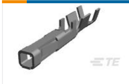
TE Part #1-794610-2 MICRO MNL RPT CNT,LS PC 30AU L