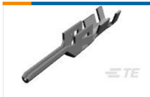
TE Part #1-794612-1 PIN CONT 20-24 15 GOLD L/P