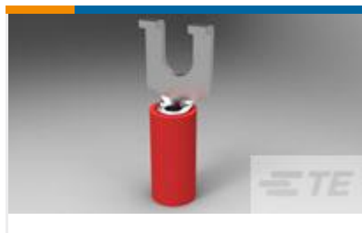
TE Part #2-32562-1 PIDG SPDFLG 22-16COMM22-18MIL6