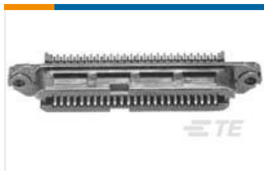
TE Part #5553921-1 ASSY, RCPT, 50 POSN, B SLOT