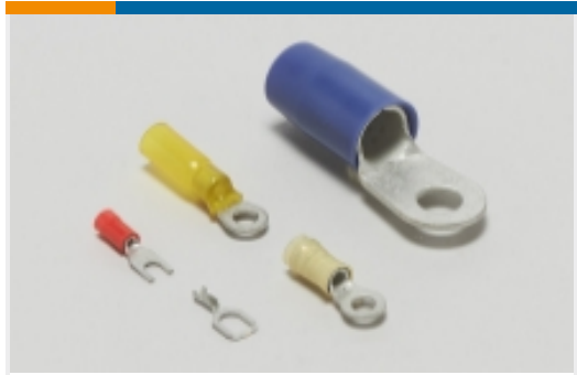
Ring Terminals & Spade Terminals(861)