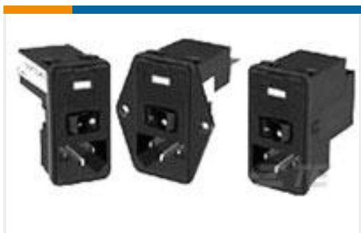
TE Part #2-6609107-2 PS000SS30=C1057