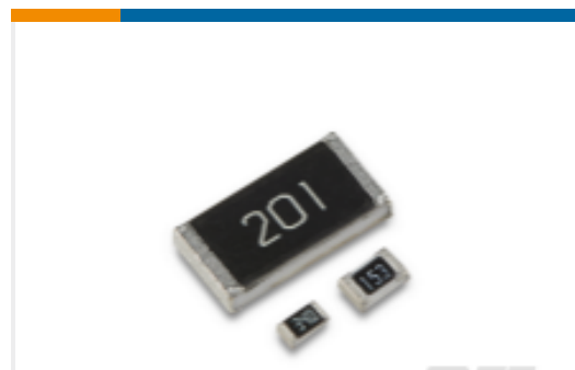
TE Part #2176325-6 CRGP 0402 27R 1%