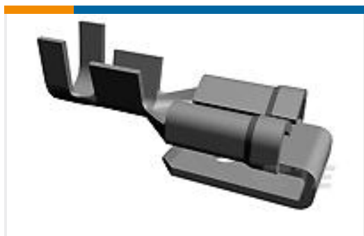
TE Part #63646-2 187 FASTON REC 20-16 AWG TPBR