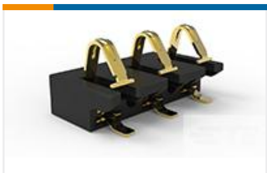
TE Part #292331-3 BATTERY 3P SMT 1.6MM PITCH ASSEMBLY CONN