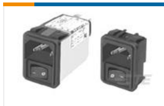
TE Part #1-6609113-4 10CFS1 S0=F7826