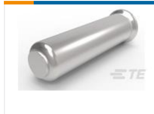
TE Part #2-331677-9 SOCKET, MIN-SPR W/KO AU SER-3