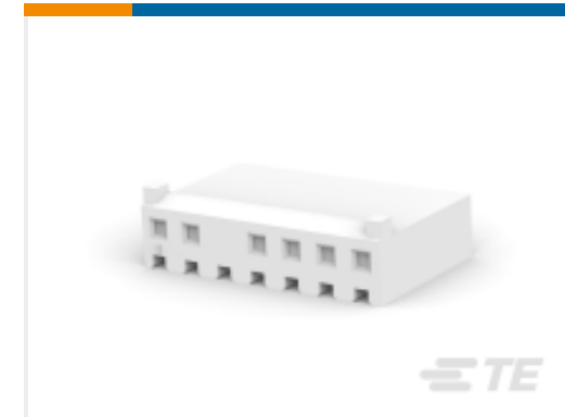
TE Part #647344-7 07P SL156 HSG W/RP TB BLK #3