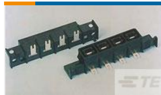
TE Part #556882-4 RCPT ASY, R/A, AMPINRGY WTB, 4POS