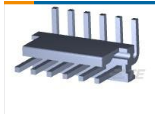
TE Part #640387-6 06P MTA156 HDR ASSY SQ R/A