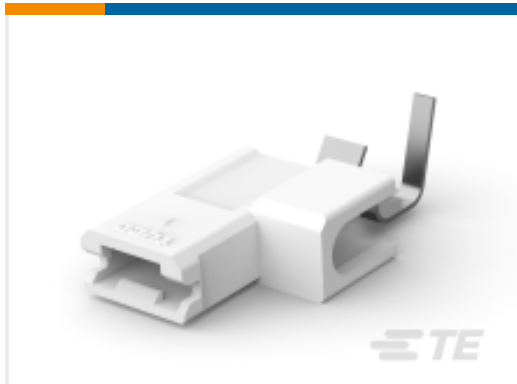
TE Part #521411-2 ULTRA POD: Flag, Receptacle Assembly, Tin Plated, .250 inch