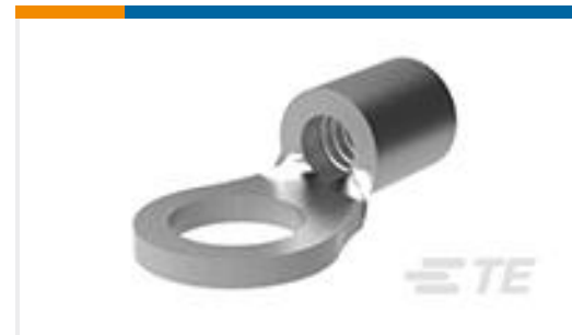
TE Part #2-34110-3 SOLIS R 22-16 COMM 22-18 MIL 6