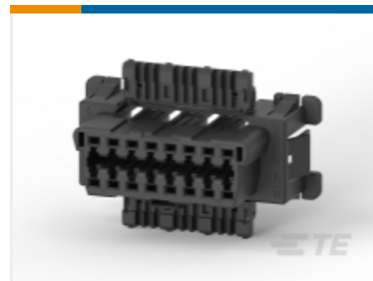
TE Part #348822-2 16 WAY DIAGNOSTIC CONN BLACK