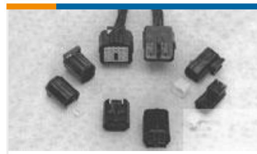
TE Part #345258-1 ANTI-BACKOUT 4WAY REC HSGECONO