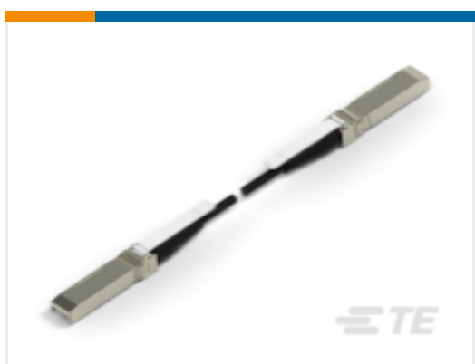
TE Part # CAT-C11-H50626 SFP+ to SFP+ I/O Cable Assembly: 30 AWG