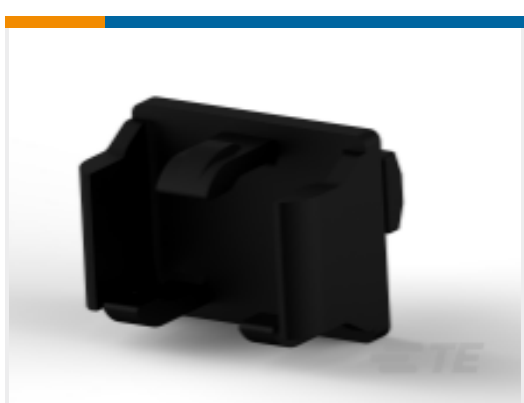
TE Part # 1761394-1 DUST COVER, SFP, GANGED & STACKED