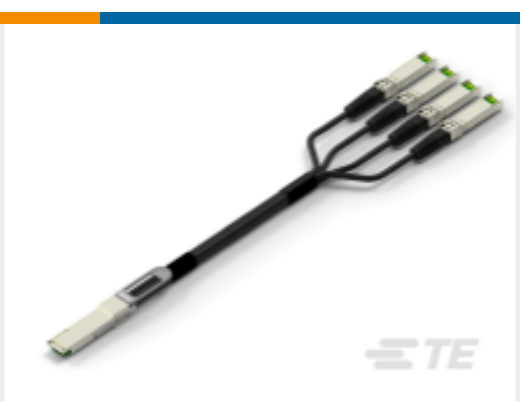
TE Part # CAT-C11-N490333 QSFP28-Four SFP+ Cable Assembly: 30 AWG