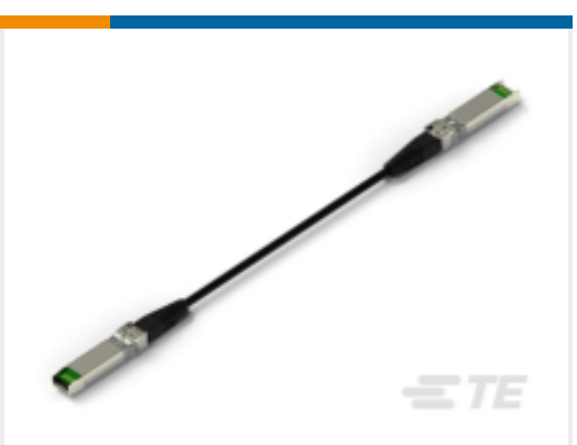
TE Part # CAT-C11-N49011 SFP28 to SFP28 Cable Assembly: 26 AWG