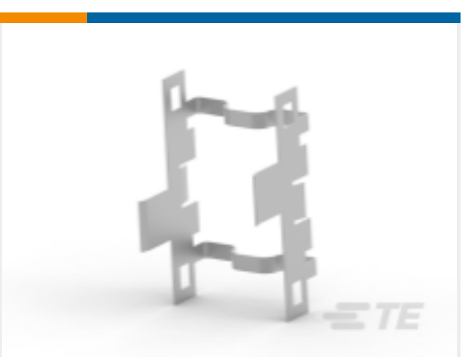
TE Part # CAT-SF59-AC229 SFP accessories