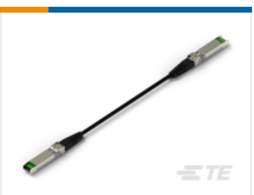
TE Part # 4-2821224-5 SFP56 DIRECT ATTACH CA, 3M, 26AWG