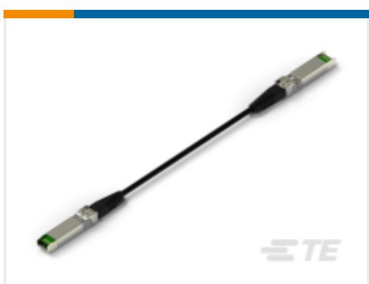
TE Part # CAT-C11-N4901114 SFP28 to SFP28 Cable Assembly: 30 AWG