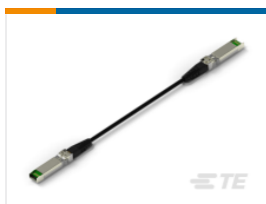
TE Part # 4-2334985-2 SFP56 DIRECT ATTACH CA, 1M, 32AWG