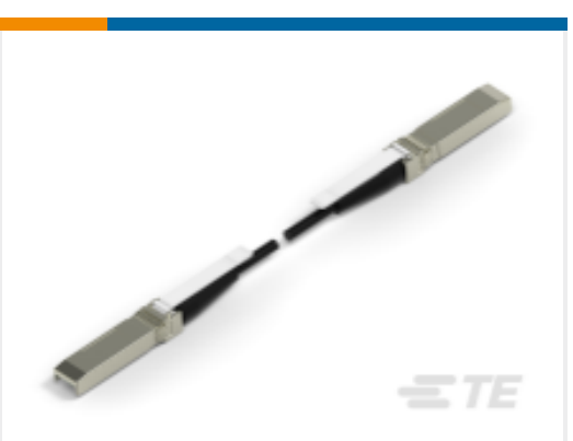
TE Part # CAT-C11-H5 SFP+ to SFP+ I/O Cable Assembly: 24 AWG