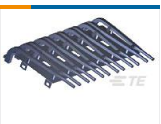
TE Part # 2007174-1 SFP Standard 1x6 Light Pipe Assm