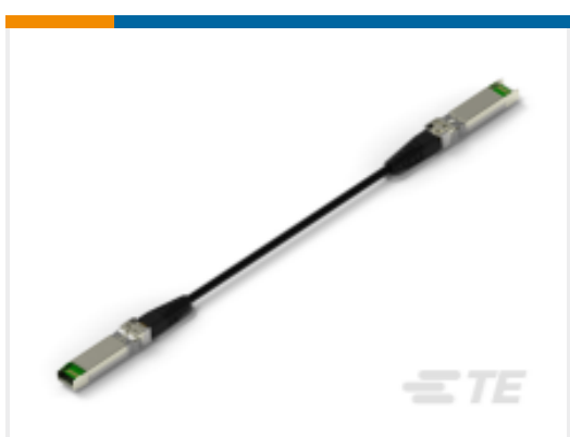
TE Part # 4-2821222-5 SFP56 DIRECT ATTACH CA, 2M, 30AWG