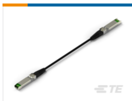
TE Part # 2334985-2 SFP28 DIRECT ATTACH CA, 1M, 32AWG