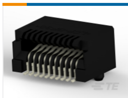
TE Part # CAT-SF59-C76264 SFP Connectors