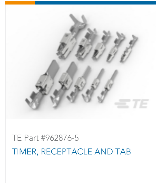
TE Part #962876-5 TIMER, RECEPTACLE AND TAB