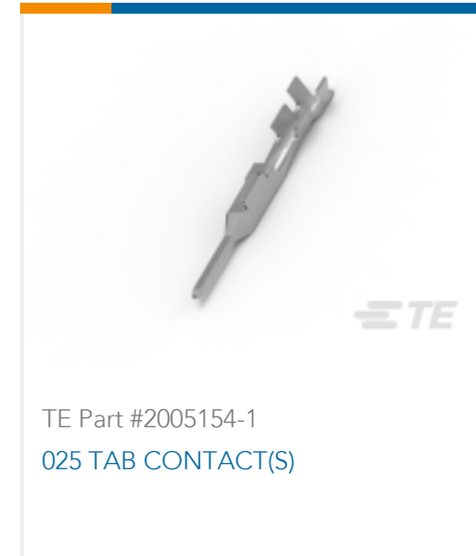
TE Part #2005154-1 025 TAB CONTACT(S)