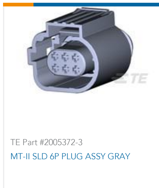
TE Part #2005372-3 MT-II SLD 6P PLUG ASSY GRAY