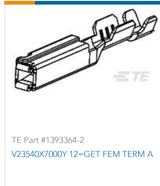
TE Part #1393364-2 V23540X7000Y 12=GET FEM TERM A