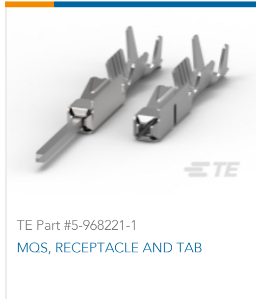
TE Part #5-968221-1 MQS, RECEPTACLE AND TAB