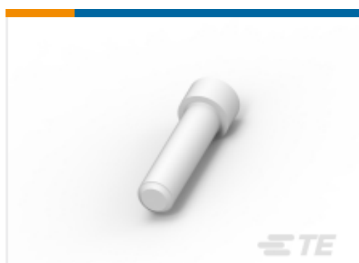
TE Part #114017-ZZ SEALING PLUG, SIZE 12/16, WHT