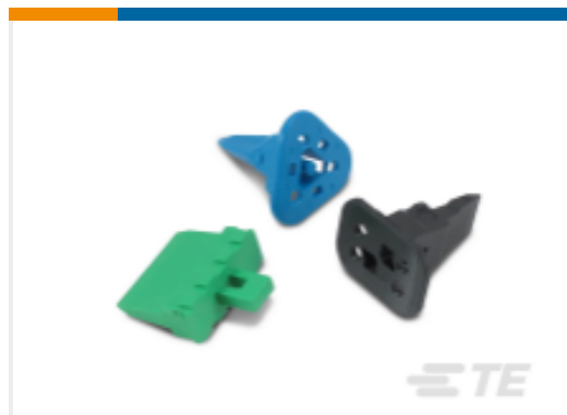
TE Part #W2S DEUTSCH DT WEDGELOCKS