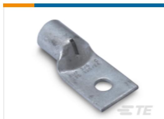
TE Part #325303 AMPOWER TERMINAL 1 STUD HOLE