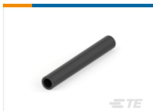
TE Part #NB15312001 CRN-1/8-0-STK