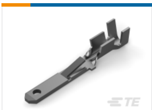
TE Part #928906-2 FF 110 TAB 20-15 AWG .016 TPPB