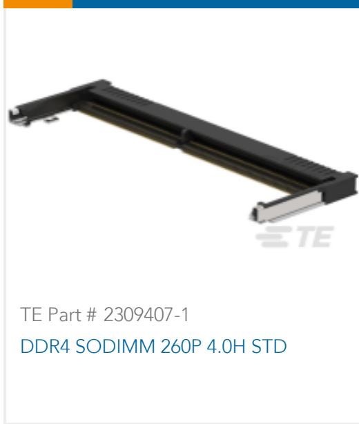
TE Part # 2309407-1 DDR4 SODIMM 260P 4.0H STD