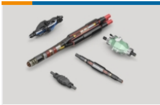
Joints & Splices(4)