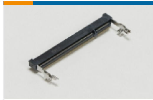
SO DIMM Sockets(13)