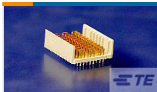
TE Part #2170245-1 HMZD+,3PAIRS,10COLS,VERTICAL, ASSEMBLY