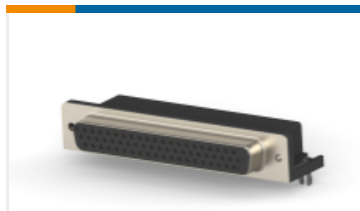
TE Part #2311771-1 AMPL REC, HD22, R/A, 62P, THREADED