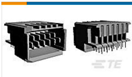
TE Part #120957-1 UPM EXPANDED PIN ASSEMBLY