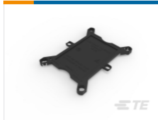
TE Part #2305234-1 SOCKET P HARDWARE DUST COVER