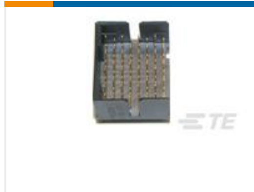
TE Part #1934304-1 Tin Man Header Assy 4x8 Right