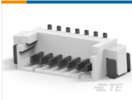
TE Part #1-1734261-2 AMP HPI 1.25MM HEADERS