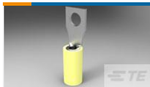
TE Part #2-327960-2 TERMINAL,PIDG RECT 12-10 6