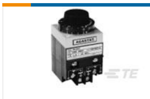
TE Part #1423162-7 7022AD=RLY,STD,OFF,2P,120VAC,5