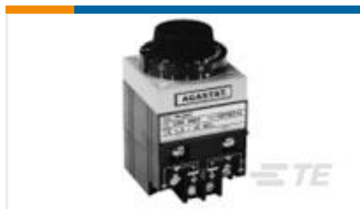
TE Part #1423162-9 7022AE=RLY,STD,OFF,2P,120VAC,2