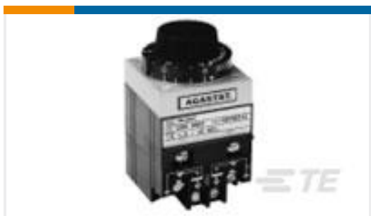
TE Part #5-1423159-2 7012SD=RLY,STD,ON,2P,250VDC,50