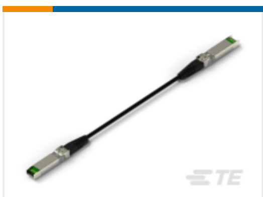
TE Part # 4-2334985-2 SFP56 DIRECT ATTACH CA, 1M, 32AWG