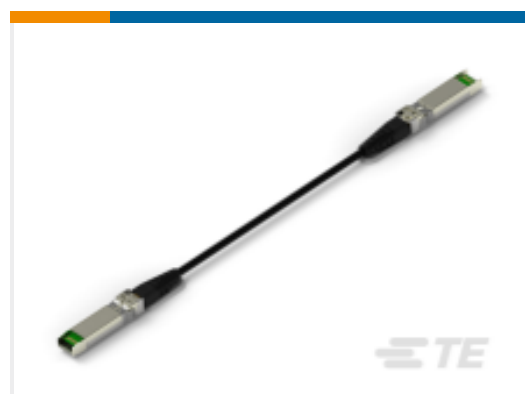
TE Part # 2334985-2 SFP28 DIRECT ATTACH CA, 1M, 32AWG