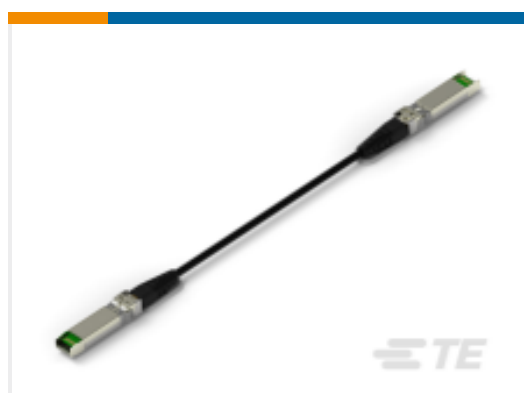
TE Part # 4-2821222-5 SFP56 DIRECT ATTACH CA, 2M, 30AWG