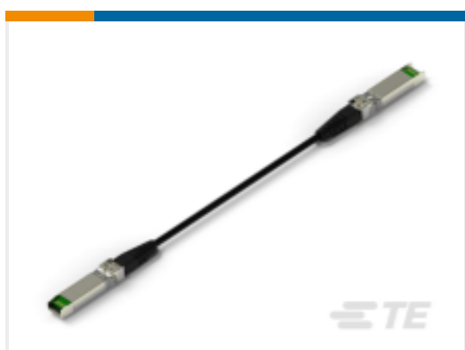
TE Part # 4-2821224-5 SFP56 DIRECT ATTACH CA, 3M, 26AWG