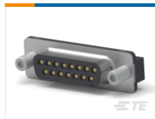
TE Part # CAT-025-DRAVS2274 D-Sub Receptacle Assembly: Vertical, Shell Size 2, 2.74mm