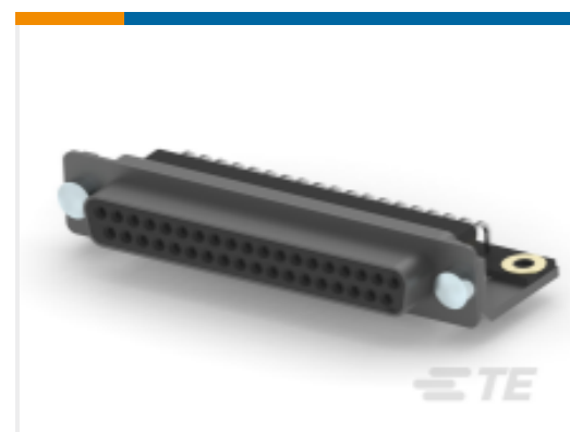
TE Part # CAT-023-DRARS4277 D-Sub Receptacle Assembly: Right Angle, Shell Size 4, 2.77mm