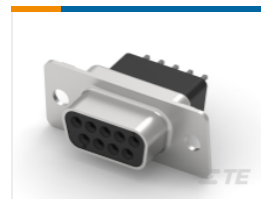
TE Part # CAT-025-DRAVS1274 D-Sub Receptacle Assembly: Vertical, Shell Size 1, 2.74mm