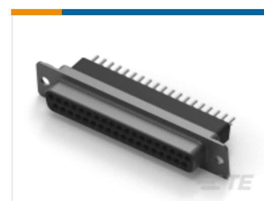
TE Part # CAT-025-DRAVS4277 D-Sub Receptacle Assembly: Vertical, Shell Size 4, 2.77mm