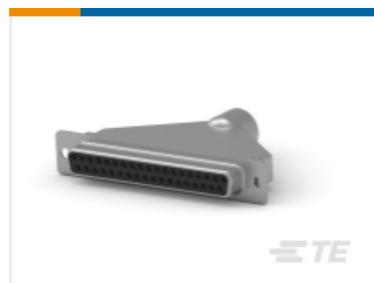
TE Part # CAT-035-DCRSS204 D-Sub Crimp Recept Signal 37 Posn, Socket Size 20, Shell Size 4