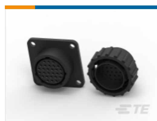
TE Part # CAT-AM71-C83998M CPC SERIES 2