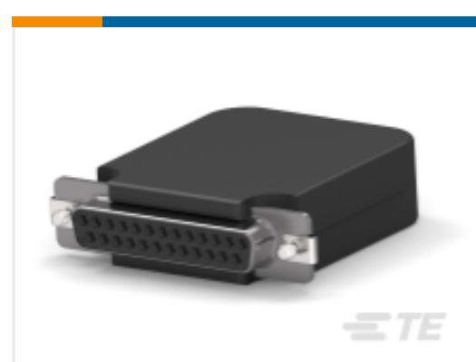
TE Part # CAT-035-DCRSS203 D-Sub Crimp Recept Signal 25 Posn, Socket Size 20, Shell Size 3