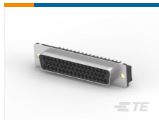
TE Part # CAT-026-RAVSAP5277 D-Sub Receptacle assy: Vertical, Action Pin, Shell Size 5, 2.77mm