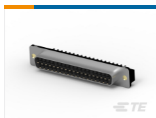
TE Part # CAT-026-RAVSAP4277 D-Sub Receptacle Assy: Vertical, Action Pin, Shell Size 4, 2.77mm