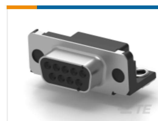
TE Part # CAT-023-DRARS1274 D-Sub Receptacle Assembly: Right Angle, Shell Size 1, 2.74mm