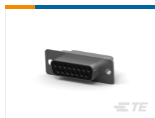
TE Part # CAT-035-DCRSS202 D-Sub Crimp Recept Signal 15 Posn, Socket Size 20, Shell Size 2