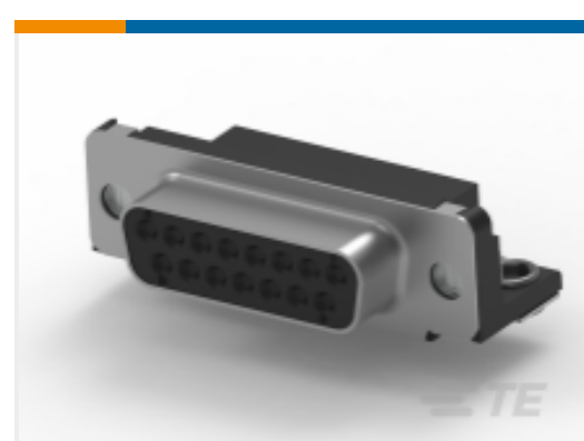
TE Part # CAT-023-DRARS2274 D-Sub Receptacle Assembly: Right Angle, Shell Size 2, 2.74mm