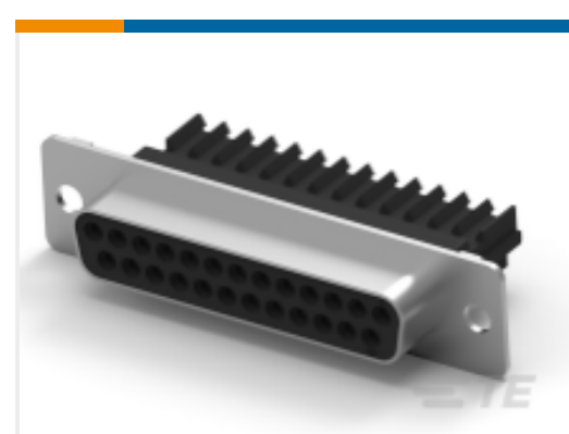
TE Part # CAT-AM7-248H5 IDC D-Sub: Receptacle Assembly, Wire to Wire, Signal, 2.77 mm