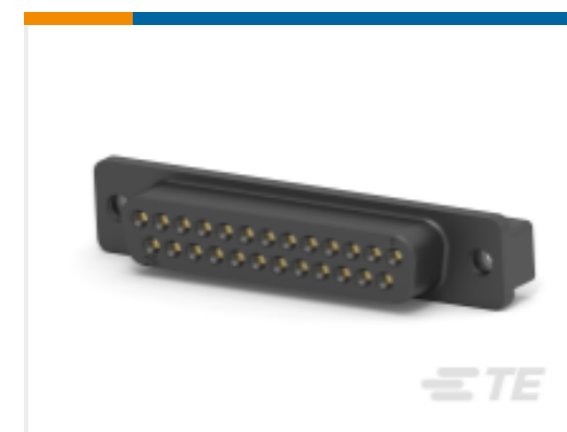
TE Part # CAT-025-DRAVS3277 D-Sub Receptacle Assembly: Vertical, Shell Size 3, 2.77mm