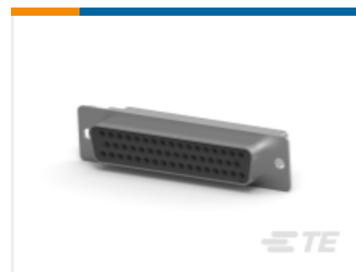
TE Part # CAT-035-DCRSS205 D-Sub Crimp Recept Signal 50 Posn, Socket Size 20, Shell Size 5