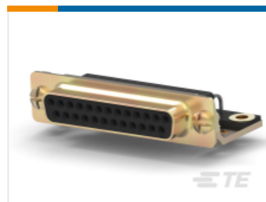
TE Part # CAT-023-DRARS3277 D-Sub Receptacle Assembly: Right Angle, Shell Size 3, 2.77mm