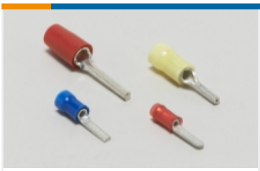
Crimp Wire Pins, Tabs & Ferrules(41)