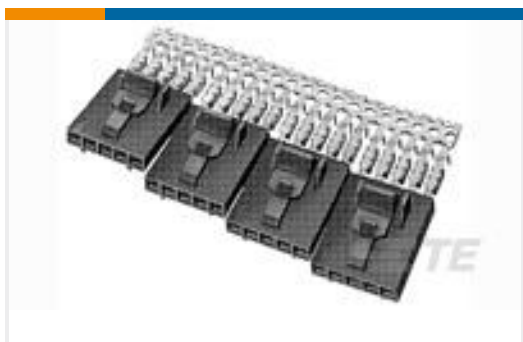
TE Part #5-103957-1 10X2 MTE RCPT SR LATCH .100CL