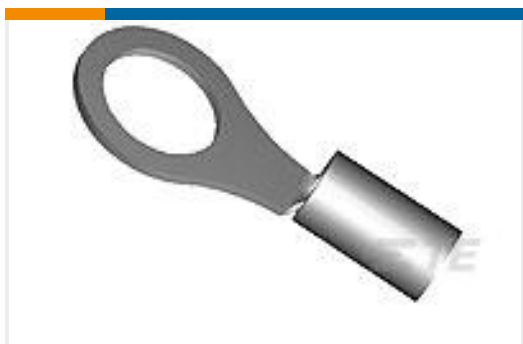
TE Part #322419 TERMINAL,BUDG R 16-14 4