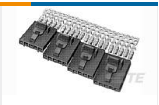
TE Part #5-103958-1 10X2 MTE RPT SR LATCH .100CL