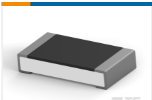
TE Part #7-2176388-6 RQ 1206 60R4 0.1% 10PPM 5K RL