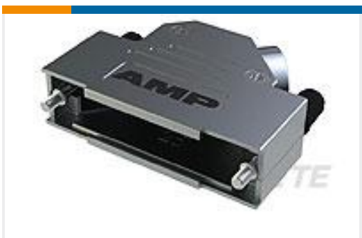
TE Part #1-1478763-5 METAL BACKSHELL 15 WAY 45 DE