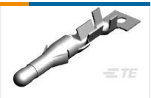
TE Part #350418-5 .093 COMM P&S PIN AU/NI/BR