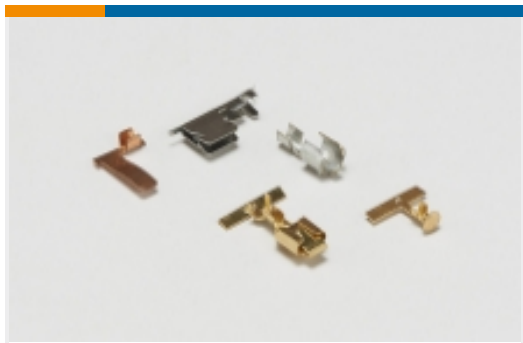
Special Purpose Terminals(1)