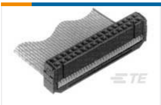
TE Part #1658623-3 16 NOVO MIL 30DP, LEAD FREE