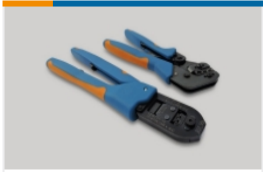
Portable Crimp Tools(2)