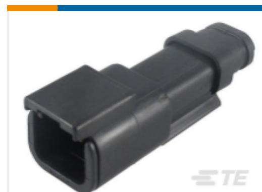
TE Part #DTM04-2P-EE03 REC, 2P, BLK, N, XCAP