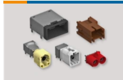
Data Connectivity Headers(2)