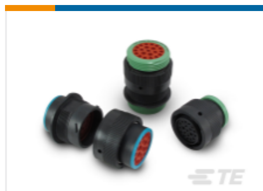
TE Part #HDP24-18-14SE-L017 DEUTSCH HDP20 HOUSINGS