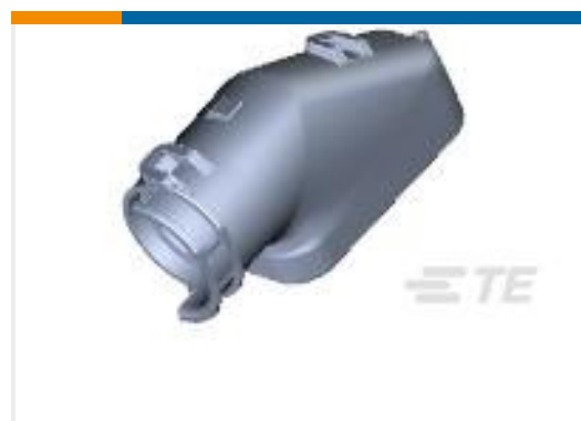
TE Part #1670865-1 COVER,90