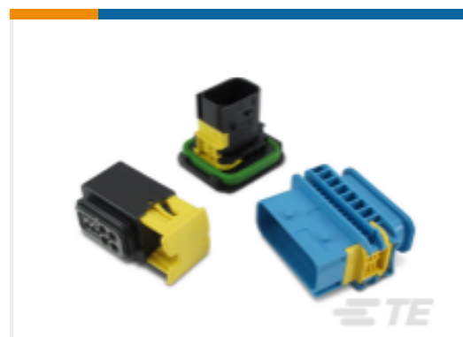
TE Part #3-1563759-1 Heavy Duty Sealed Connector Series Housings