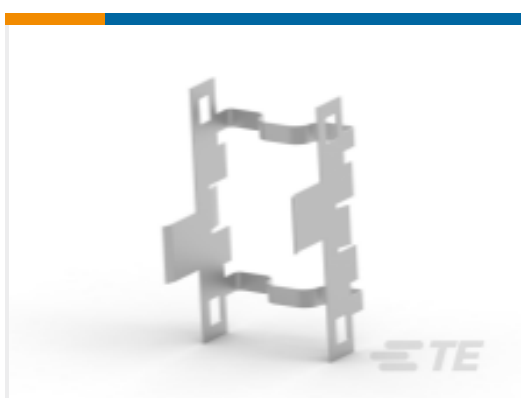
TE Part # CAT-SF59-AC229 SFP accessories