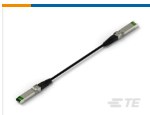
TE Part # 4-2821222-5 SFP56 DIRECT ATTACH CA, 2M, 30AWG