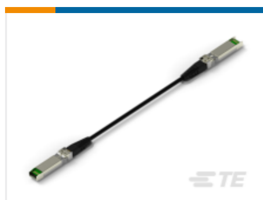
TE Part # 4-2334985-2 SFP56 DIRECT ATTACH CA, 1M, 32AWG