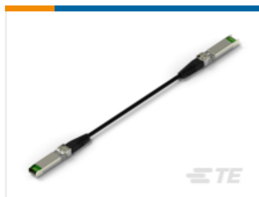
TE Part # 2334985-2 SFP28 DIRECT ATTACH CA, 1M, 32AWG