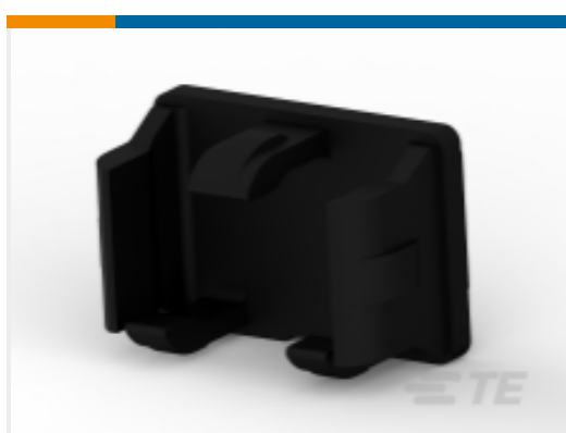
TE Part # 1367147-3 SFP COVER, UNPL, NO LOGO