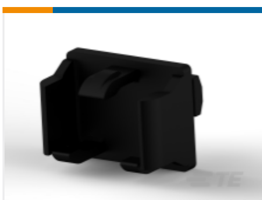
TE Part # 1761394-1 DUST COVER, SFP, GANGED & STACKED