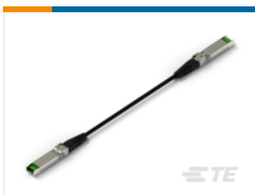
TE Part # 4-2821224-5 SFP56 DIRECT ATTACH CA, 3M, 26AWG