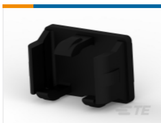
TE Part # 1367147-1 SFP COVER, UNPLATED