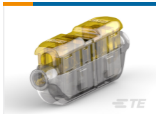
TE Part #2213600-7 COOLSPICE LW 12/14 TO 12/14 AWG, SEAL