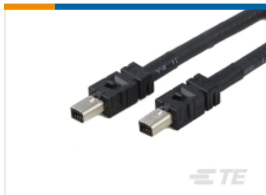
TE Part #2-2205131-3 CA MINI IO MINI IO TYPE I