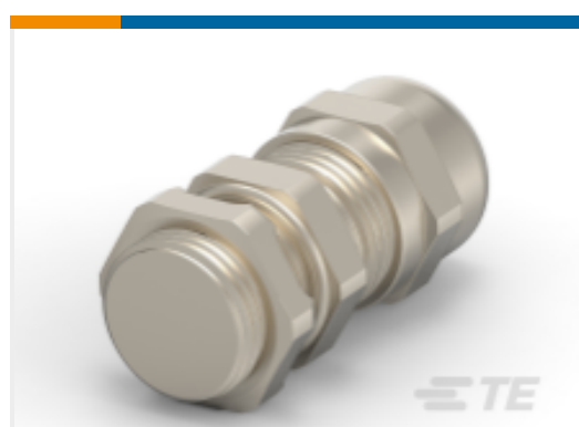
TE Part #1478885-1 PG EMC GLAND PG7