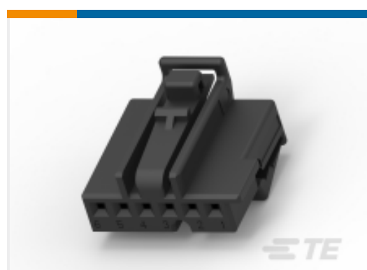
TE Part #1-969508-2 6POS MOS REC COD A