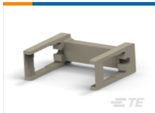
TE Part #1-100103-6 Latch Connector: Strain Relief