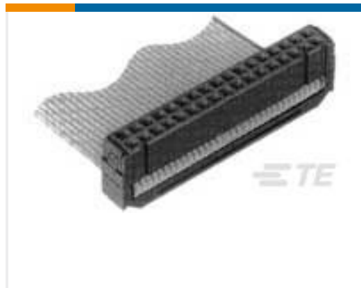
TE Part #1658623-4 20 NOVO MIL 30DP, LEAD FREE