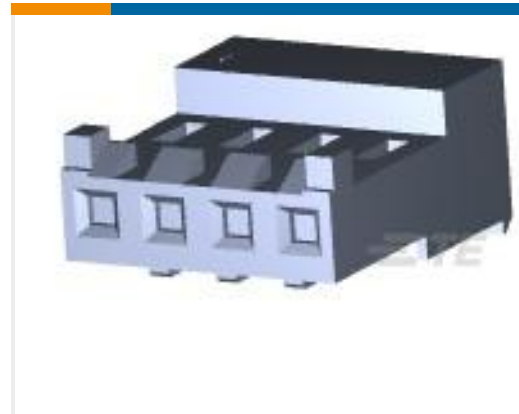
TE Part #3-643817-4 04P MTA156 CONN ASSY 18AWG ORA