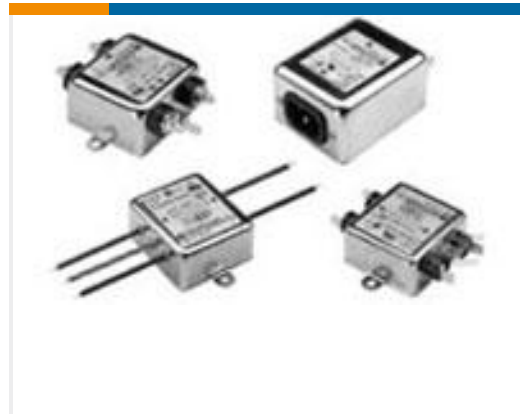
TE Part #6609028-9 5VK1 M0=F7139