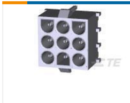
TE Part #641972-1 09P UMNL PIN HDR ASSY 94VO