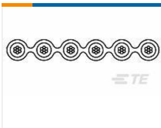
TE Part #57040-4 Madison Spec 100-4703 Rev. 7