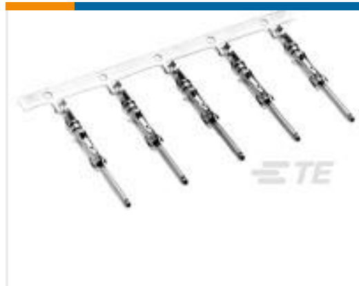
TE Part #66098-8 III+ PIN,18-16,15AU/FL,STRIP