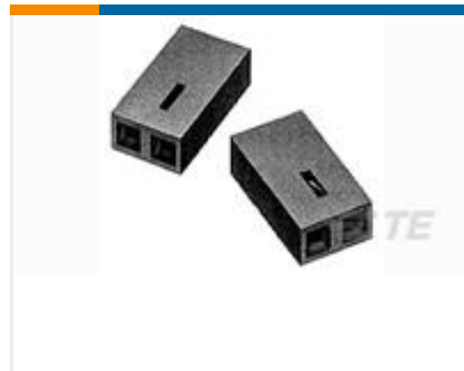
TE Part #4-530153-1 TDM SPRING, SHUNT ASY 2 POS