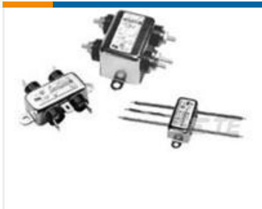
TE Part #6609021-7 5VB1=F7126 S0