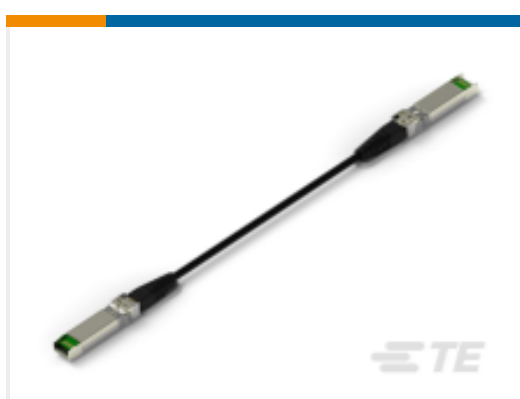
TE Part # 4-2821224-5 SFP56 DIRECT ATTACH CA, 3M, 26AWG