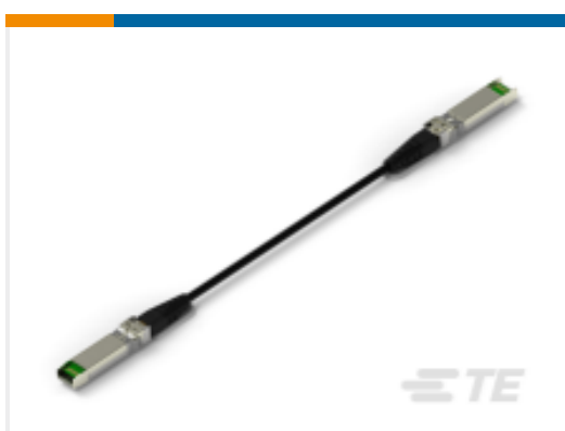
TE Part # CAT-C11-N490114 SFP28 to SFP28 Cable Assembly: 30 AWG