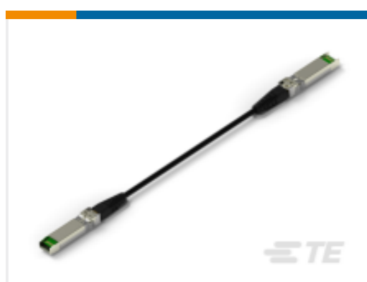
TE Part # 4-2334985-2 SFP56 DIRECT ATTACH CA, 1M, 32AWG