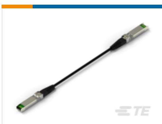
TE Part # 4-2821222-5 SFP56 DIRECT ATTACH CA, 2M, 30AWG