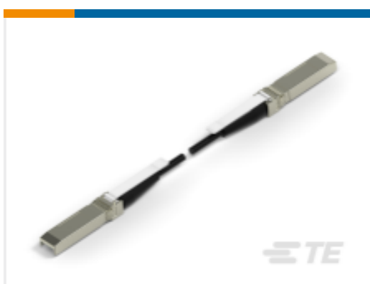
TE Part # CAT-C11-H50626 SFP+ to SFP+ I/O Cable Assembly: 30 AWG