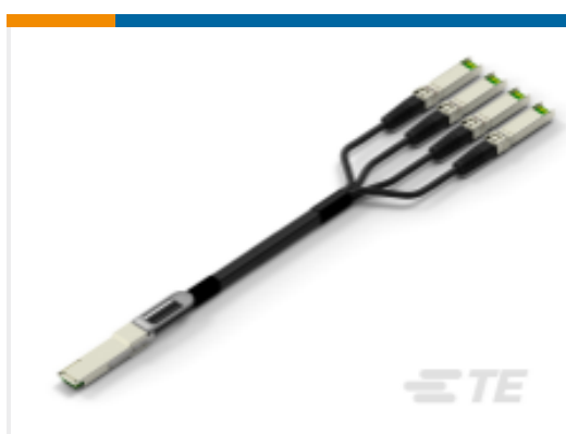
TE Part # CAT-C11-N490333 QSFP28-Four SFP+ Cable Assembly: 30 AWG