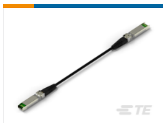
TE Part # 2334985-2 SFP28 DIRECT ATTACH CA, 1M, 32AWG