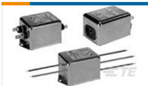
TE Part #1-6609037-0 20EP6=F7810 S0