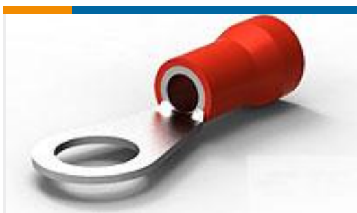
TE Part #52291-5 TERMINAL R PG 8 3/8