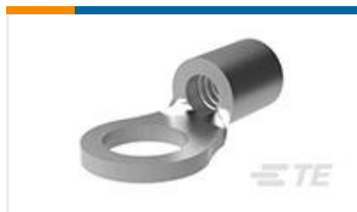
TE Part #50334 TERMINAL,SOLIS R 26-22 2