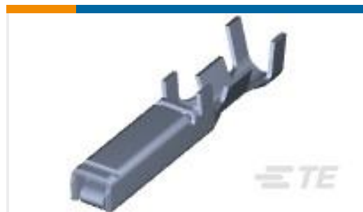
TE Part #175195-3 DYNAMIC D-3 REC CONT/M AU 0.76