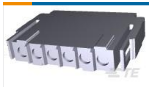
TE Part #207377-1 HSG,PLUG 6 POSN,METRIMATE