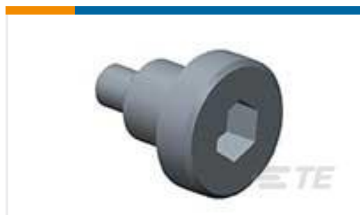
TE Part #1650402-1 902-83-02113=SCREW,SHLDR,8-32