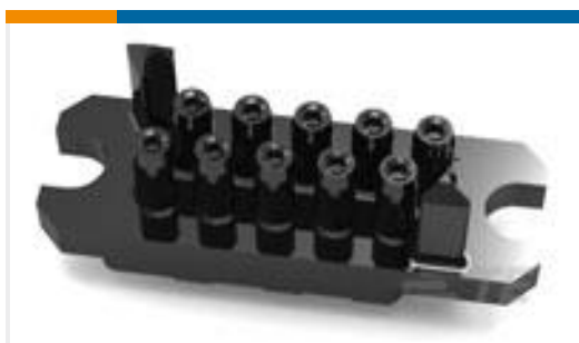
TE Part #1648596-1 296-0093-01100=CONN,SKT,MARKED