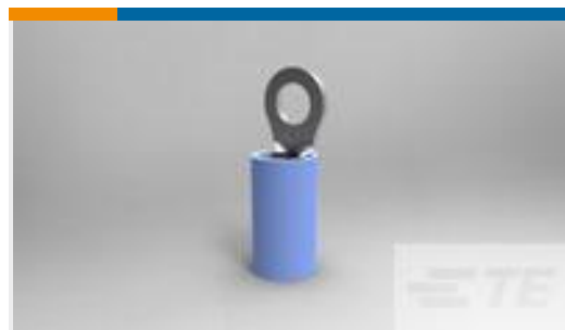
TE Part #2-320619-1 TERMINAL,PIDG R 16-14 6