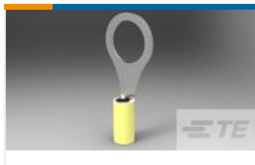
TE Part #35150 TERMINAL,PIDG R 12-10 3/8