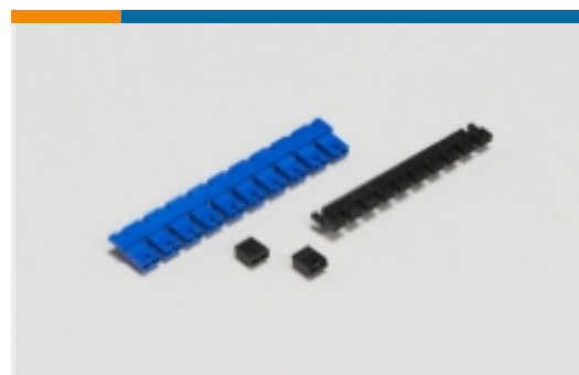
Board-to-Board Jumpers & Shunts(7)