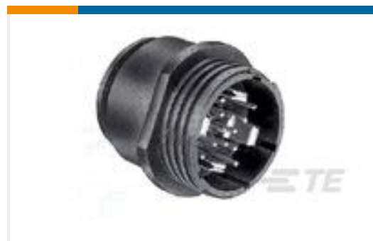
TE Part #211825-2 CPC RECPT ASSEMBLY SIZE 23-13