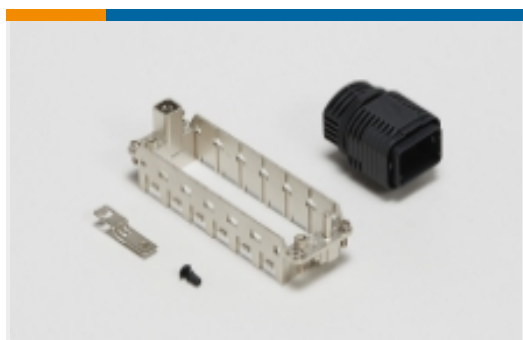
Rectangular Connector Hardware(52)