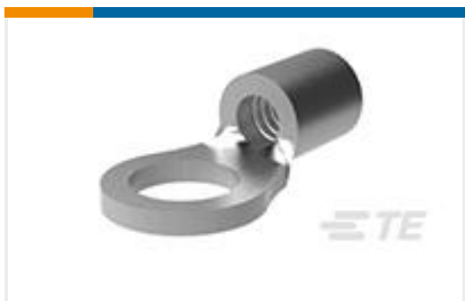
TE Part #33462 TERMINAL,SOLIS R 8 5/16