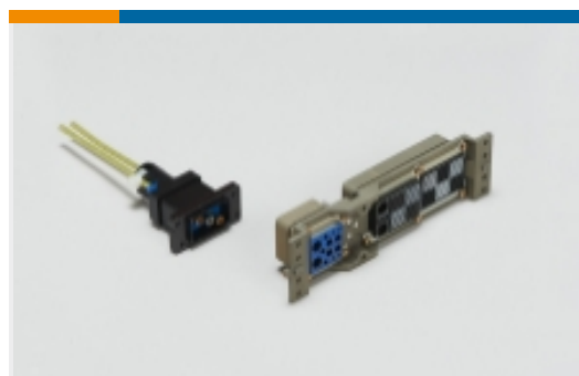
Rack & Panel Connectors(1)