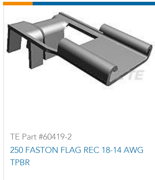
TE Part #60419-2 250 FASTON FLAG REC 18-14 AWG TPBR