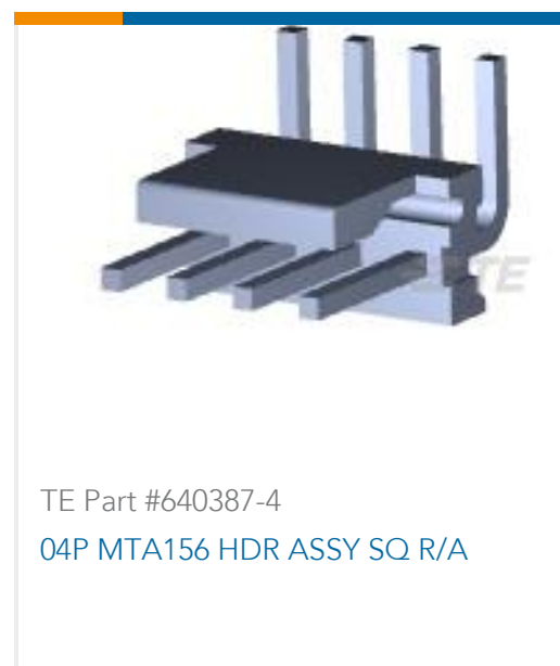
TE Part #640387-4 04P MTA156 HDR ASSY SQ R/A