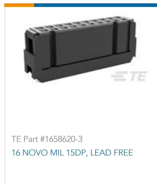
TE Part #1658620-3 16 NOVO MIL 15DP, LEAD FREE