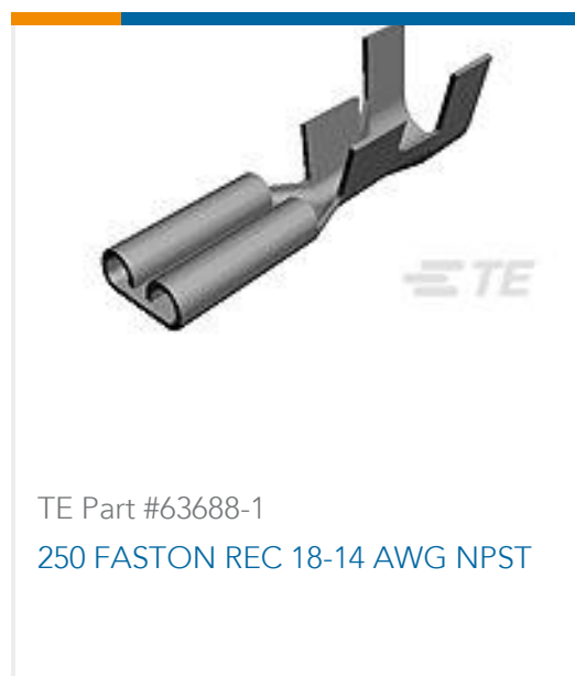
TE Part #63688-1 250 FASTON REC 18-14 AWG NPST