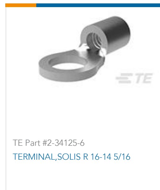
TE Part #2-34125-6 TERMINAL, SOLIS R 16-14 5/16