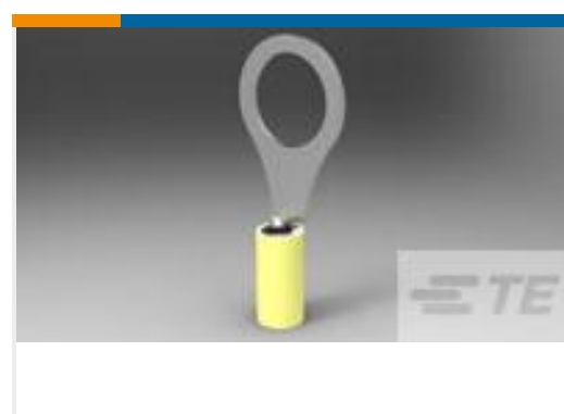
TE Part #2-320577-3 TERMINAL, PIDG R 12-10 3/8