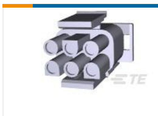
TE Part #1-480704-9 06P UMNL PLUG HSG BLK