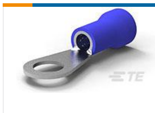
TE Part #52264-5 TERMINAL R PG 6 3/8