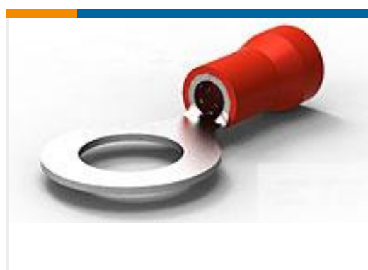
TE Part #52262-1 TERMINAL R PG 8 1/2