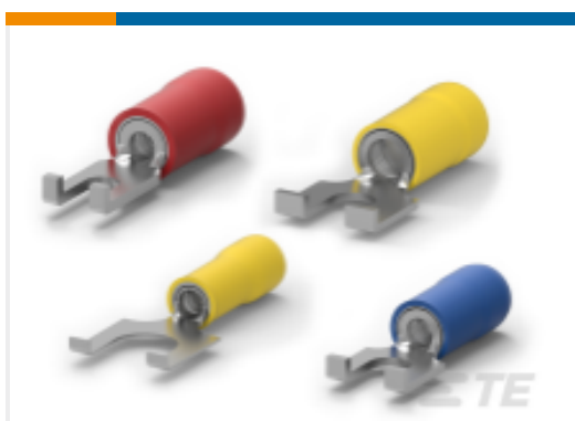
TE Part #2-32561-1 PIDG FLANGED SPADE TONGUE TERMINALS