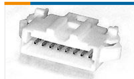
TE Part #1-292215-2 MINI CT SGL RELAY 12P NAT