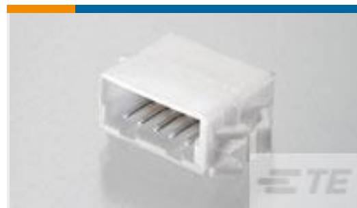
TE Part #1-292254-4 CT RELAY HDR ASSY 14P NAT