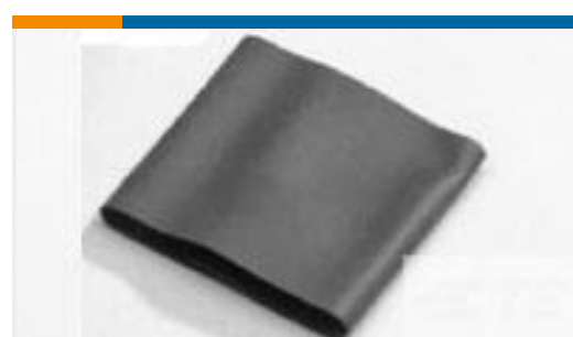
TE Part #779783J001 V2-3.5-0-SP-SM