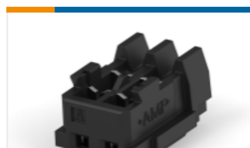
TE Part #2-353293-2 1.5MM CT MT REC ASS'Y 2P BLACK