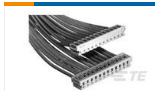
TE Part #179228-7 CT CRIMP-2 REC HSG 7P NATURAL