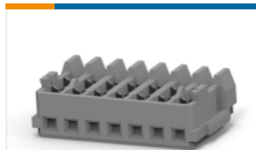
TE Part #353908-4 Mini Common Termination (CT) Housings