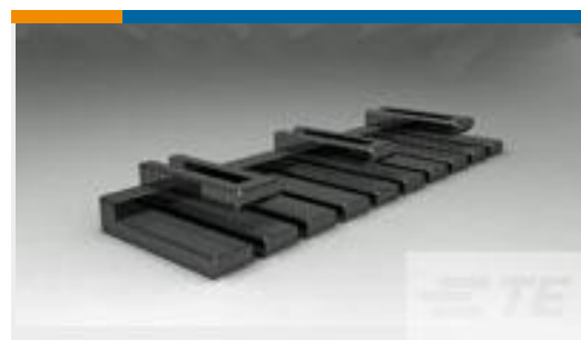
TE Part #1969443-4 EP 2.5 TPA Retainer, 4 Pos