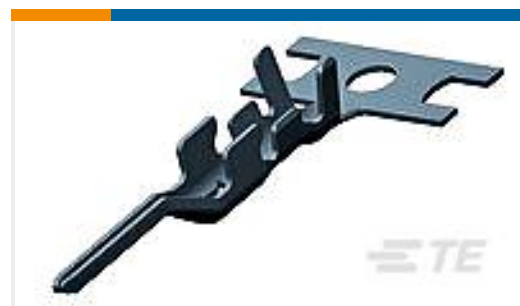
TE Part #2238007-1 TERMINAL, PIN, LANCELESS, 22-26 AWG, EP2