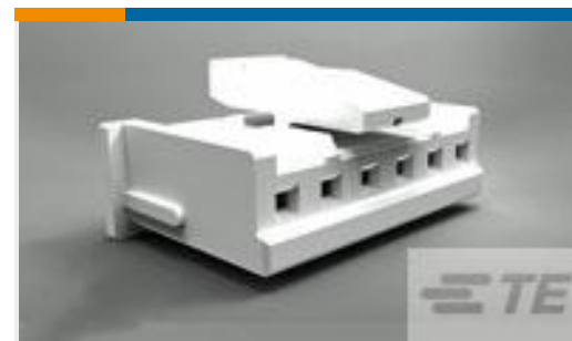
TE Part #1969442-4 EP 2.5 TPA Housing, 4 Pos