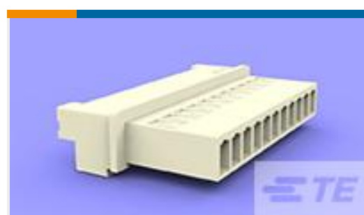
TE Part #1969588-3 HSG, REC, FREE-HANGING, SINGLE ROW, EP2.5