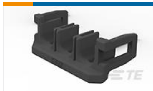
TE Part #1971777-3 PTL TPA HIGH TEMP 1 x 3 BLACK