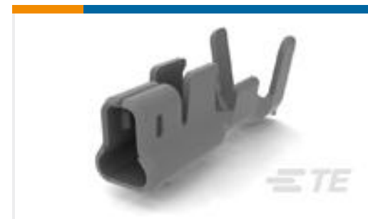
TE Part #1744423-1 EP 2.5 RCPT CONTACT, 24-20 AWG