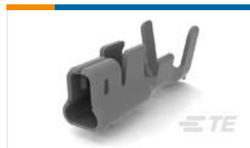
TE Part #2110989-1 EP 2.5 RCPT CONTACT, 26-22 AWG